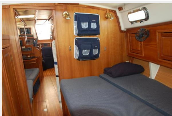
Forward cabin, looking aft