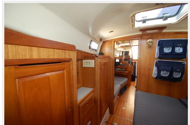
Forward cabin lockers