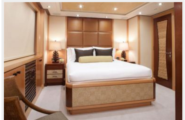
Twin/Queen Guest Stateroom