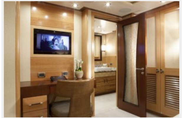
Queen Guest Starboard