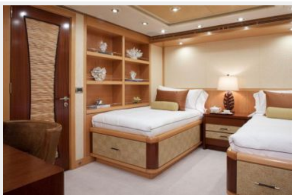
Twin/Queen Guest Stateroom