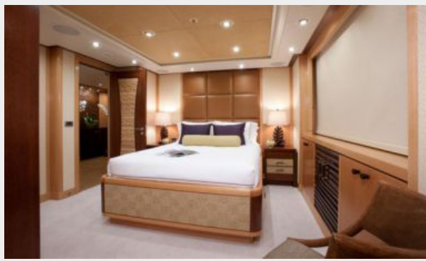
Queen Guest Starboard