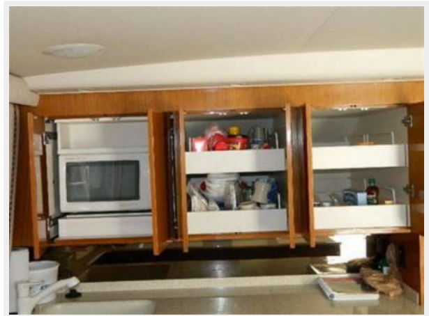
Galley 3 - Cabinets