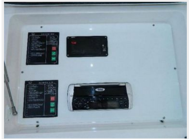
Helm / Electronics & Navigation 3