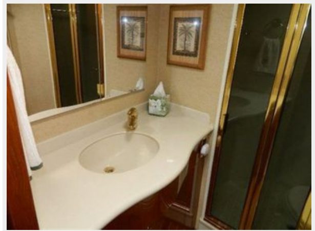
Master Head 1