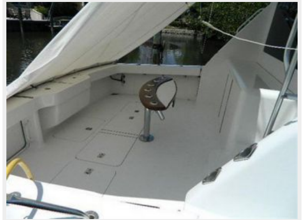
Cockpit / Fishing Equipment 1