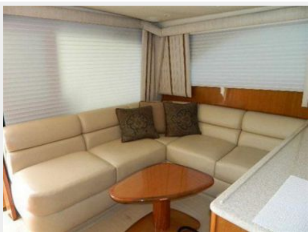
Salon 1 - Sofa