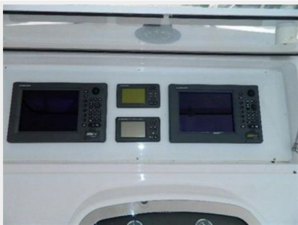
Helm / Electronics & Navigation 4