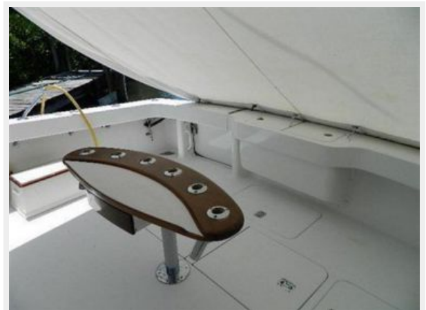
Cockpit / Fishing Equipment 3 - Rocket Launcher