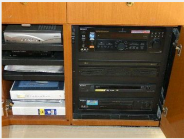
Salon 5 - Entertainment System