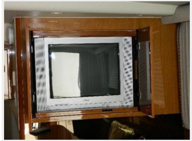
Salon 4 - TV