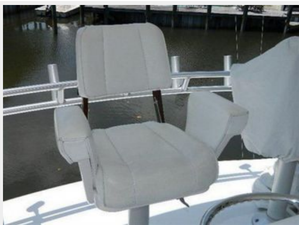
Deck 1 - Helm Seat