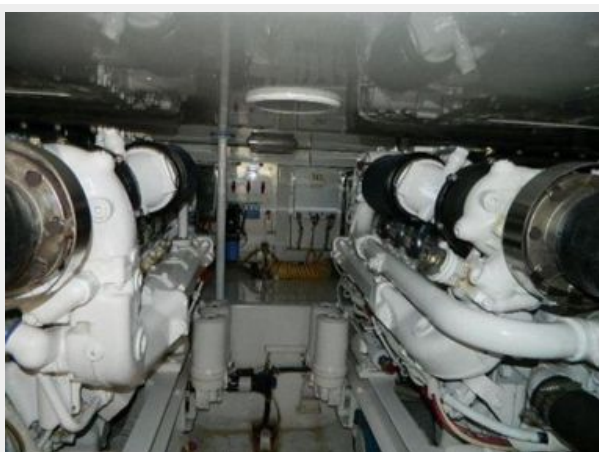
Engine & Mechanical Equipment 1 - Engine Room