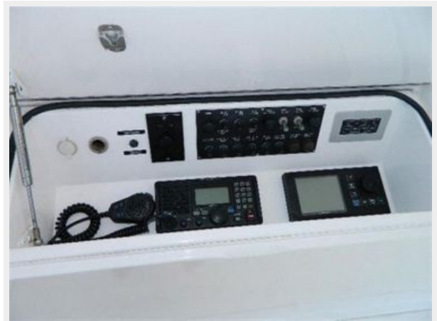
Helm / Electronics & Navigation 5