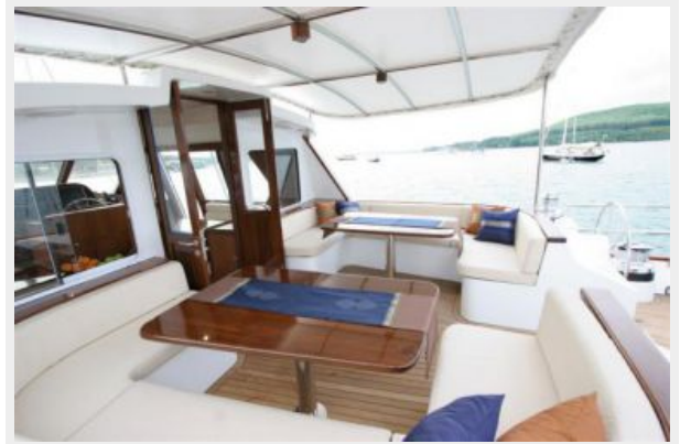
Outside lounge & dining