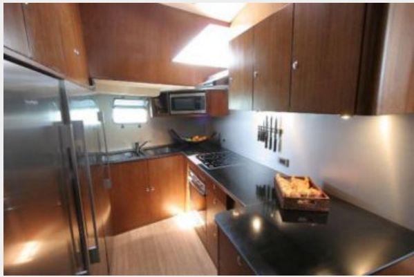
Well equipped galley