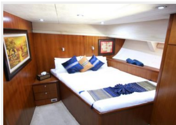
Guest cabin double