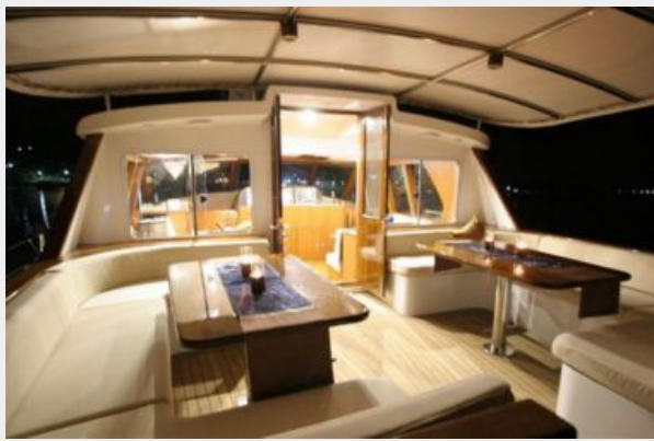
Cockpit seating area