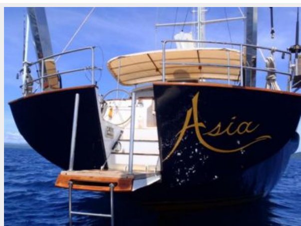
Easy access for watersports