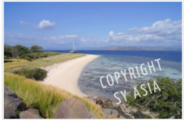
SY Asia in Komodo