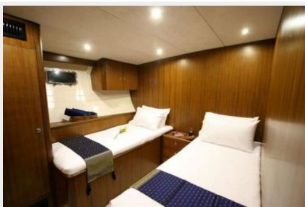
Guest cabin interchangeable Twin or King