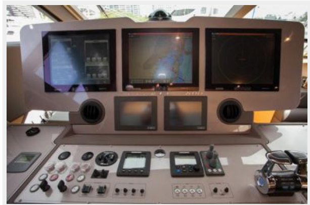
Lower helm station