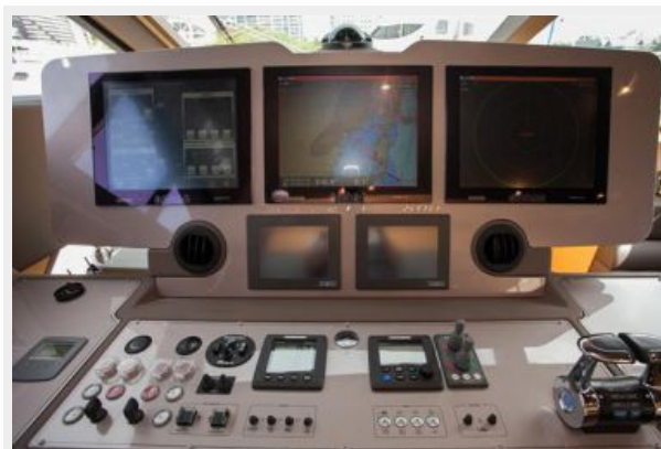
Lower helm station