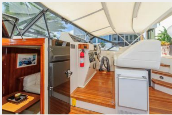
Cockpit Ice Maker