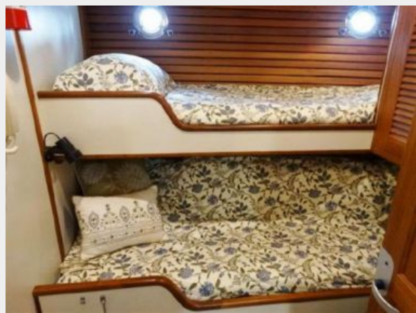
Port Guest Berths