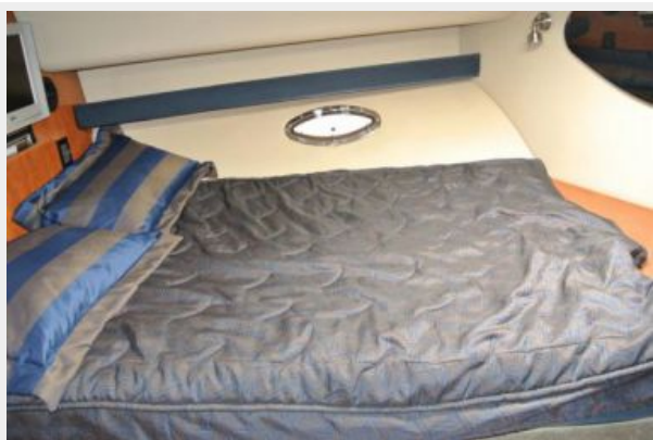
Guest Cabin Double Berth