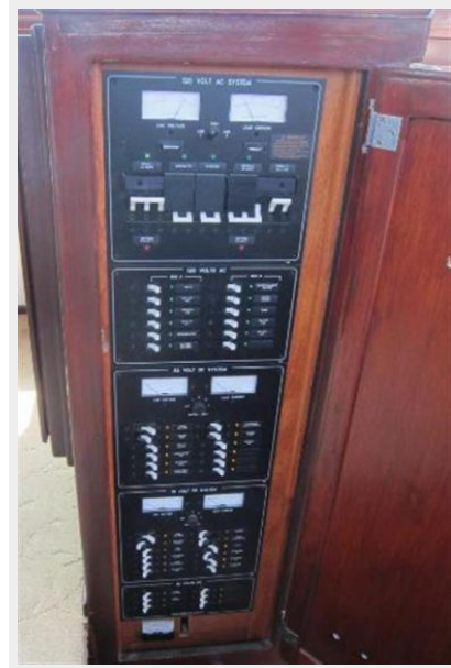
Upgraded electrical panel