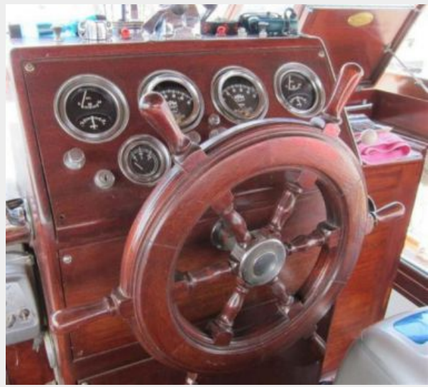
Helm - all gauges work