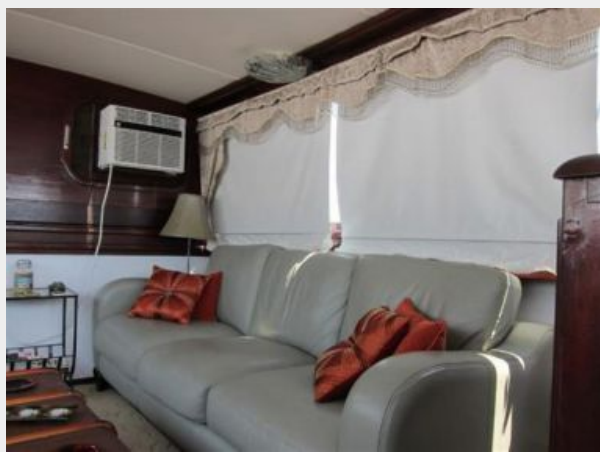
Salon Port looking aft