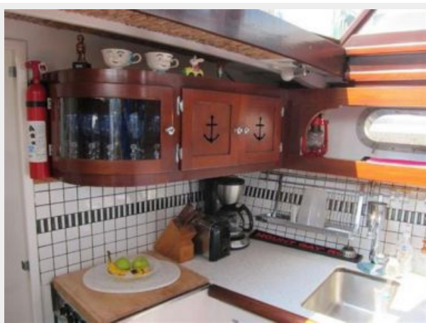
Galley down Starboard side