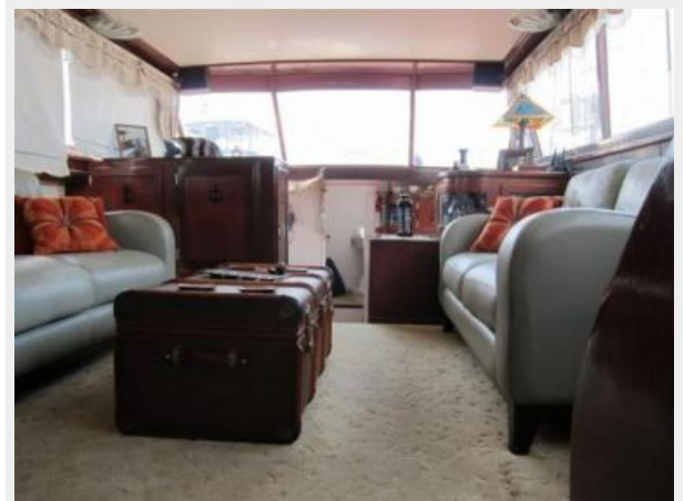
Salon looking forward