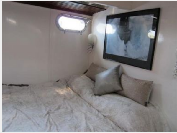
Queen Berth Aft Stateroom