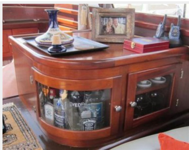
Custom Salon Cabinet Starboard