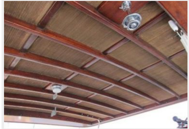
Hardtop at helm