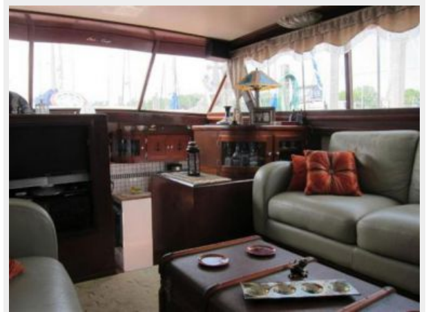
Salon Starboard looking forward