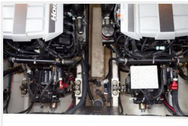
Engine Room 2