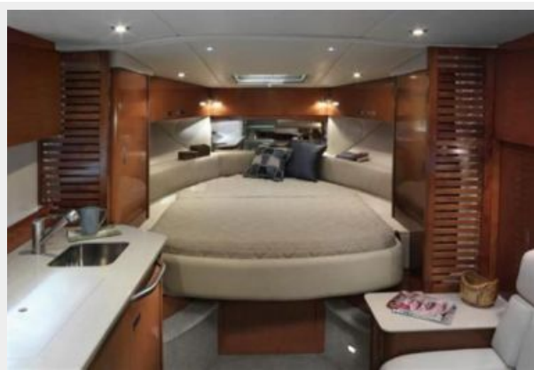
Bed Down - Manufacturers Image