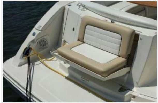
Fold Away Transom Seat