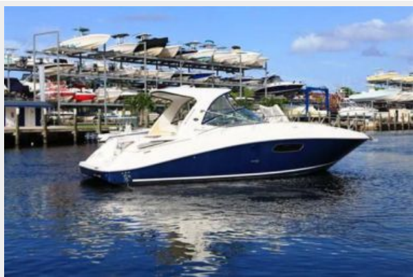
Aft Starboard Quarter