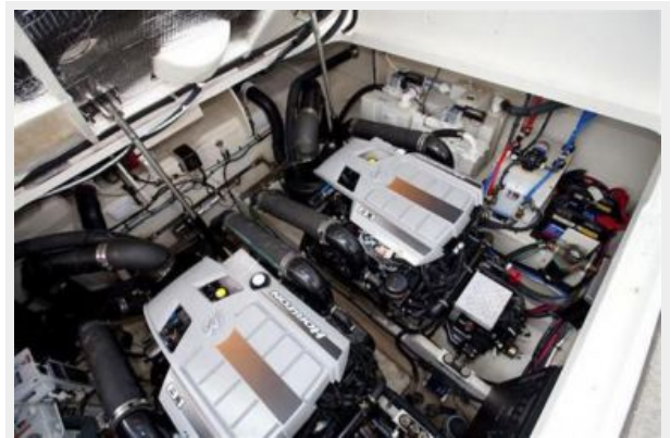
Engine Room 1