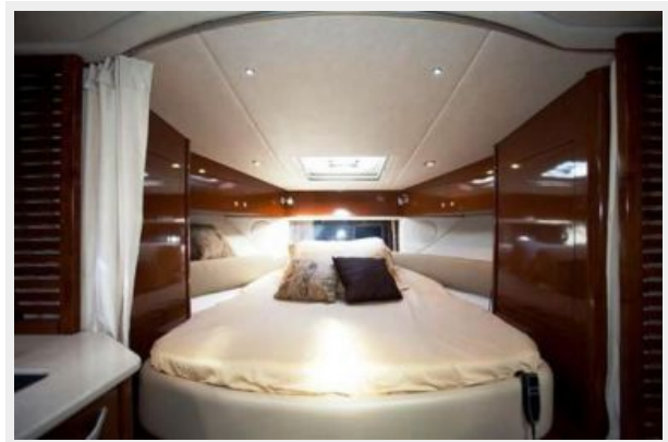
Forward Island Berth