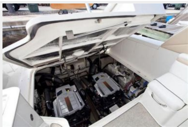
Engine Room 4