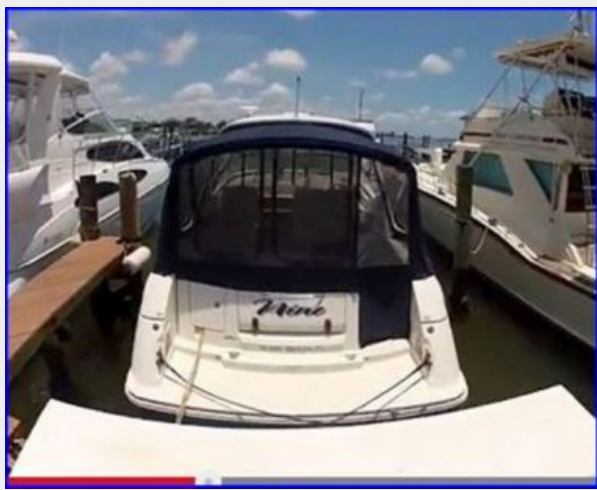
Transom with New Camper Canvas