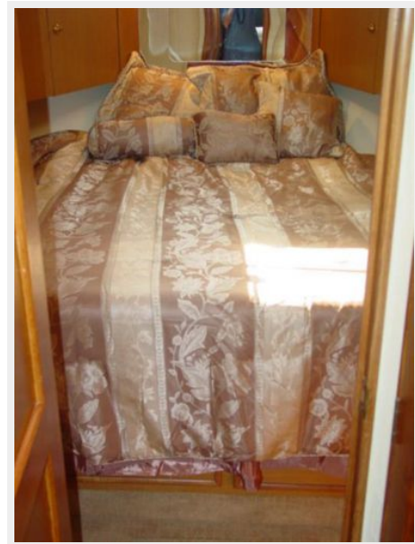
Guest Stateroom - Forward