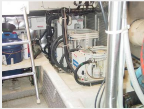
Engine & Mechanical Equipment 4