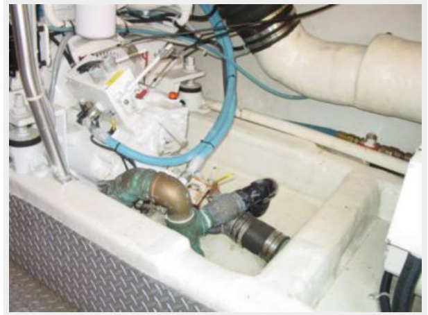
Engine & Mechanical Equipment 5