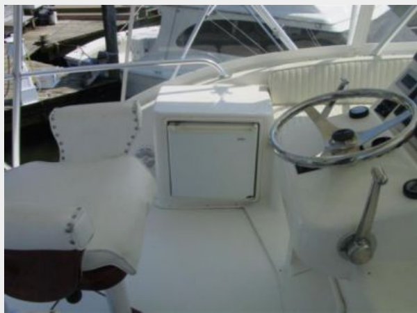
Deck 6 - Refrigerator on Helm Deck