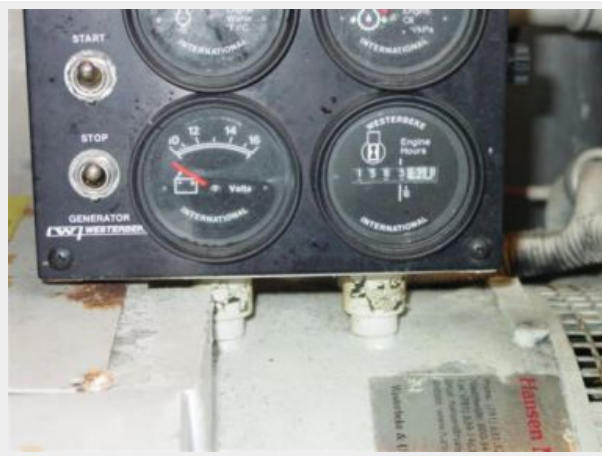
Engine & Mechanical Equipment 6