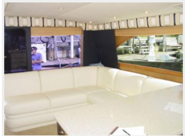
Salon 1 - Sofa