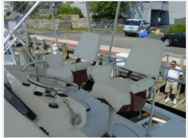
Deck 5 - Helm Seats