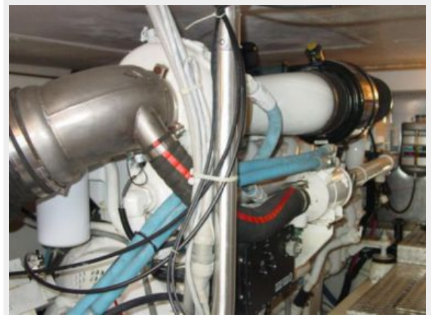
Engine & Mechanical Equipment 1