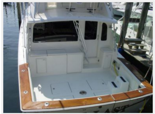
Cockpit / Fishing Equipment 1