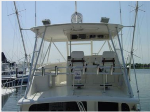
Deck 4 - Helm Deck