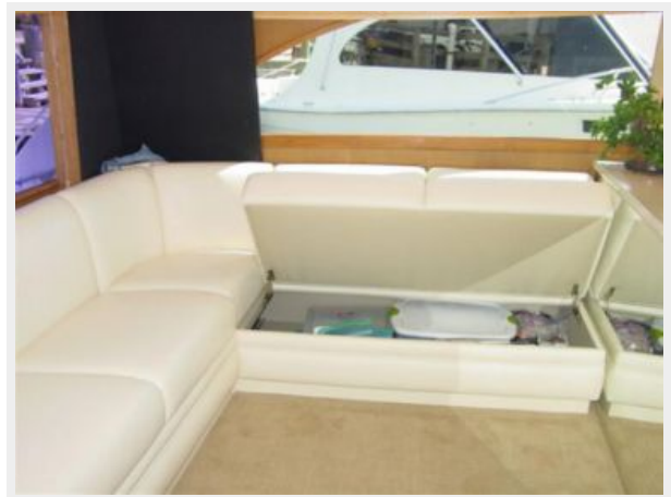
Salon 3 - Sofa Rod Storage