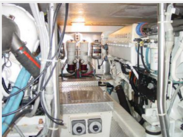
Engine & Mechanical Equipment 2