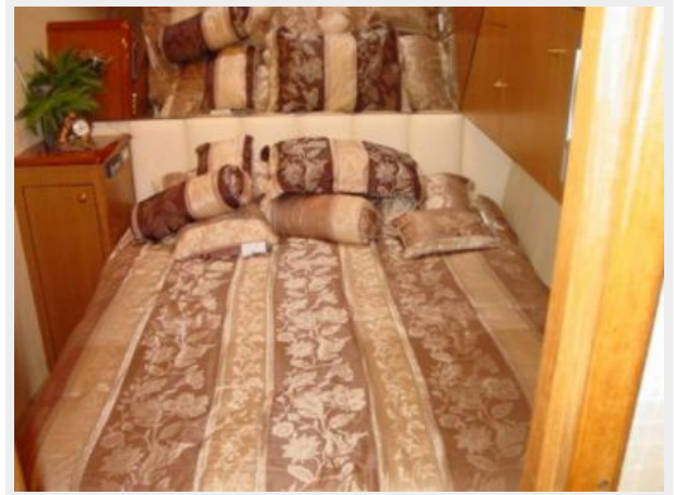
Guest Stateroom - Forward