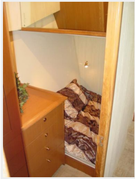
Guest Stateroom - Amidship