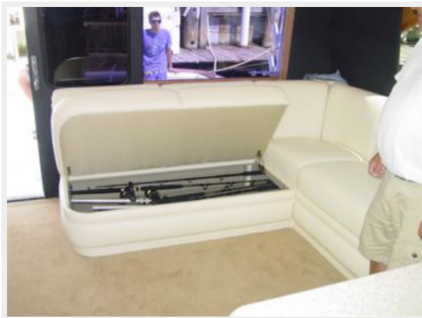
Salon 2 - Sofa Rod Storage