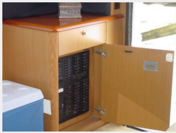
Salon 8 - Electric Breaker Panel