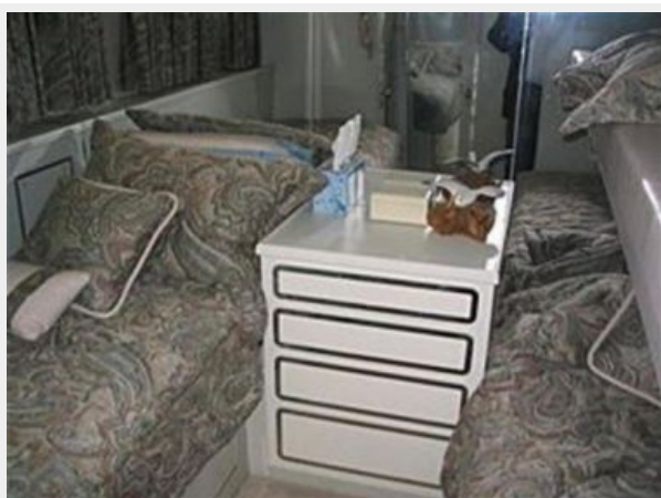
Guest Stateroom Port