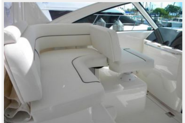
Port Helm Seating