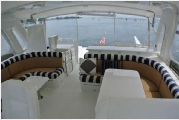
Flybridge looking aft