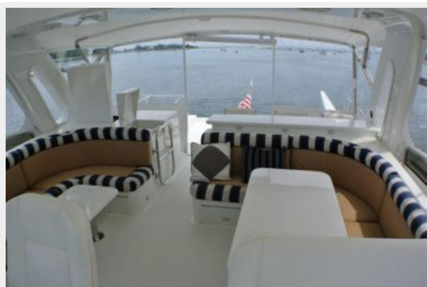
Flybridge looking aft