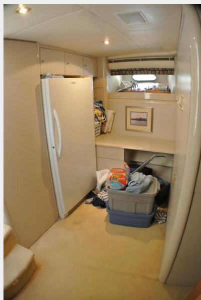
Laundry and storage