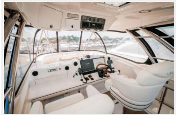
Helm and Controls