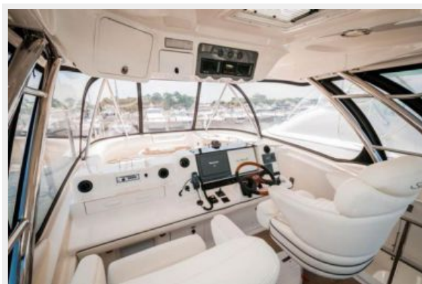
Helm and Controls