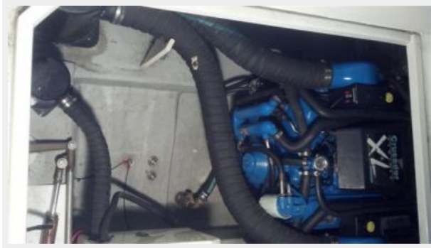
Port eng after replacement, 8-20-14