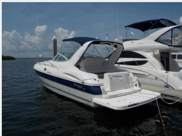
Aft Port Quarter