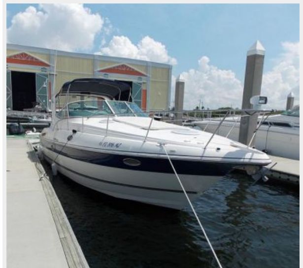
Forward Starboard Quarter