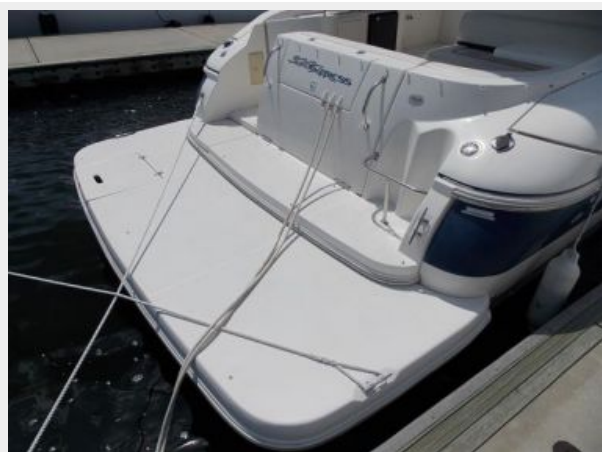
Forward Port Quarter