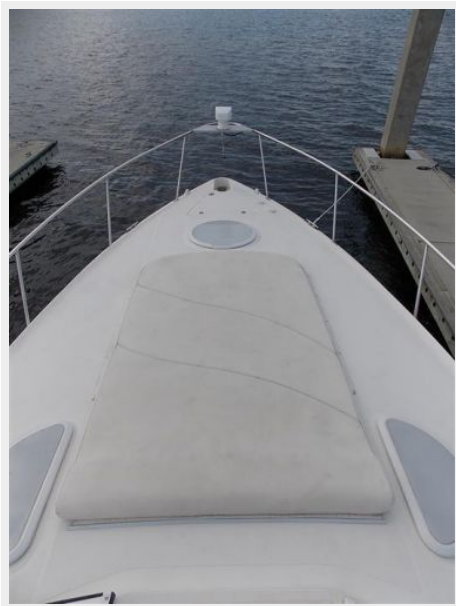
Windlass and Spotlight