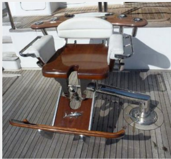
Tuna Tower Looking Forward