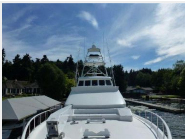
Bow Looking Aft