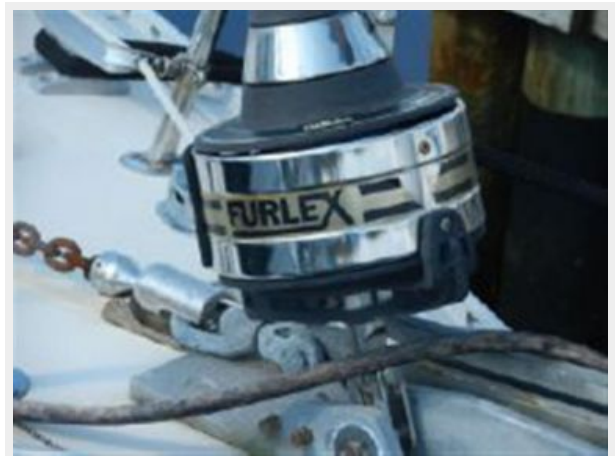
Roller Furling Genoa