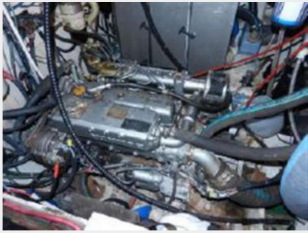
43 hp Yanmar 3135 hrs