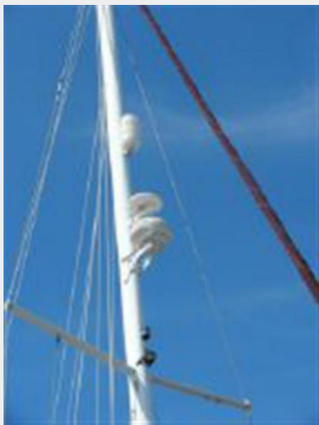
Mast, Radar, Satellite Weather