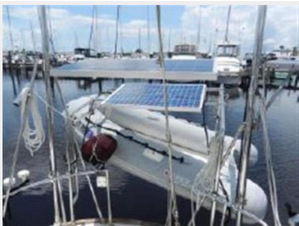
Dinghy on Davits, outboard hoist