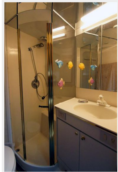
Guest Head / Starboard