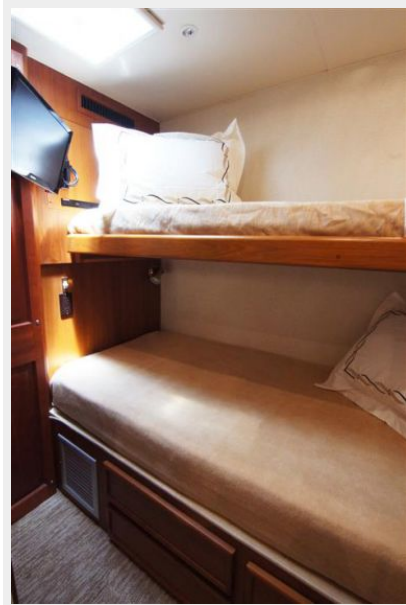
Guest Stateroom / Starboard