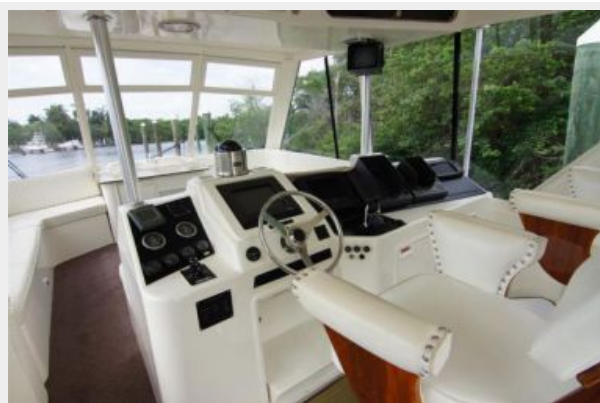
Flybridge / Helm