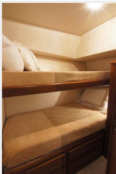
Guest Stateroom / Port