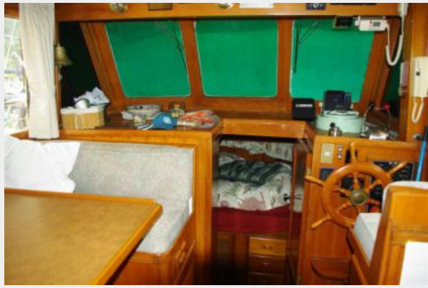
Dinette to port and the stateroom are below