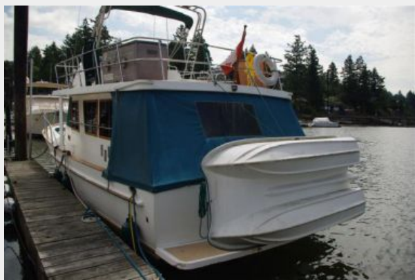
At the dock aft