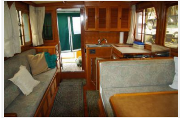
Dinette etc looking aft