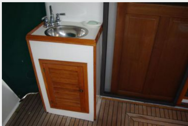
Cockpit sink & storage