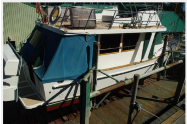
Up on the hard