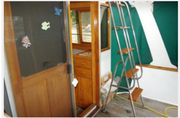
Cockpit door and ladder for bridge access