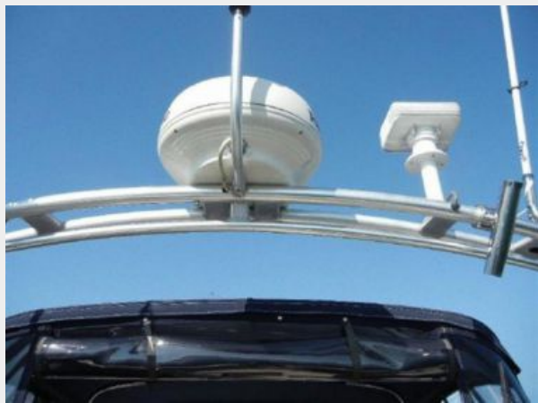
Radar & Spotlight