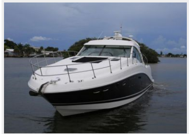
Port Bow Profile