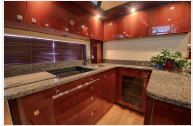
Galley Port (2)