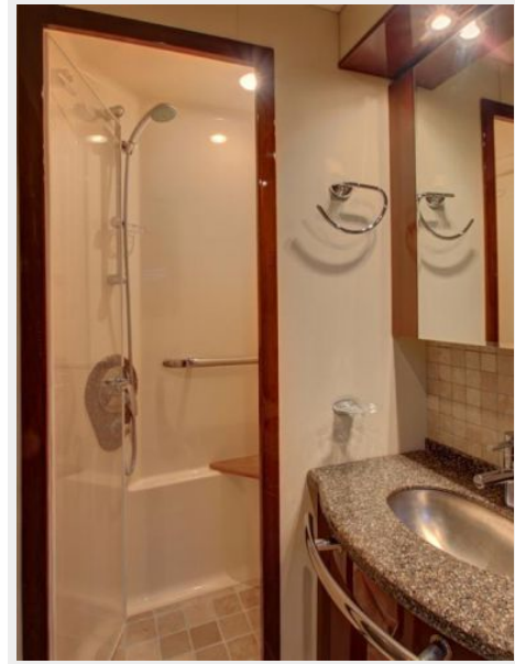
Master Head Shower