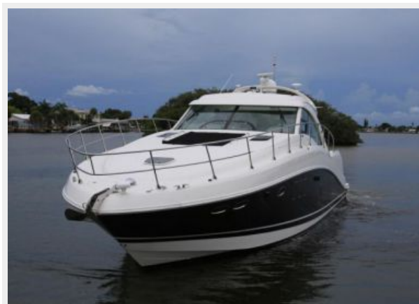
Port Bow Profile