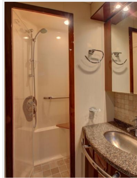
Master Head Shower