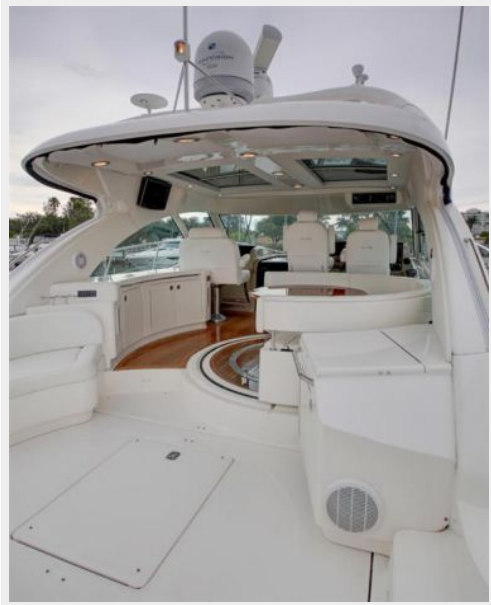
Aft Deck Forward