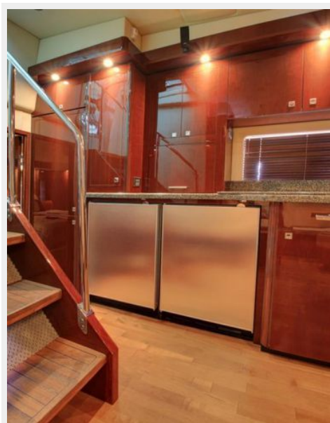
Galley Refrigerator / Freezer