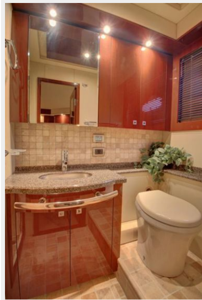
Master Head (2)