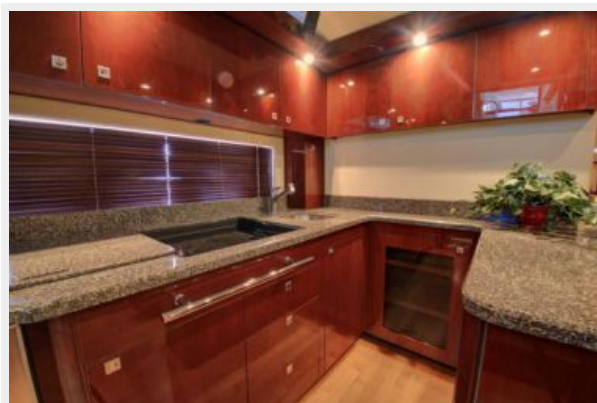
Galley Port (2)