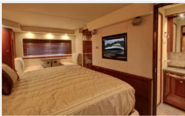
Master Stateroom To Port