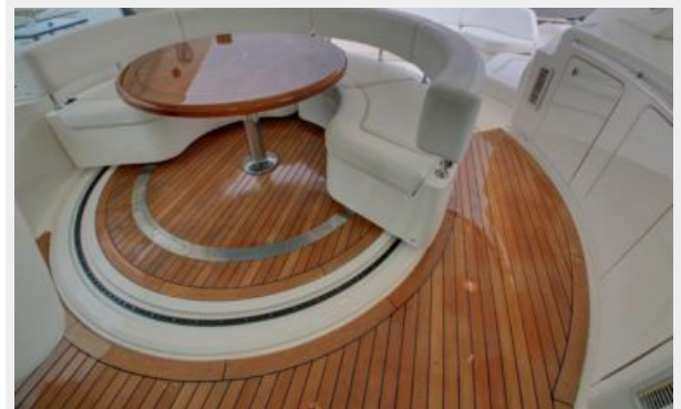
Cockpit High Gloss Table