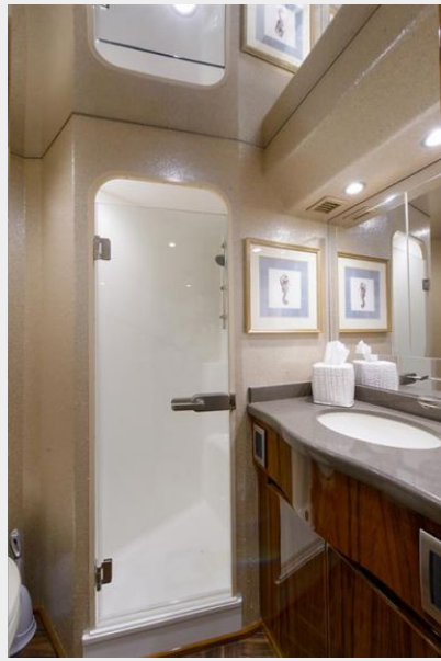
VIP Stateroom Head