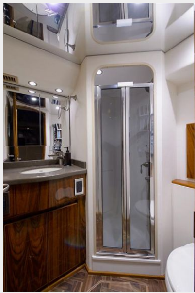
Guest Stateroom Head