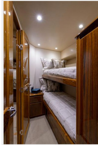
Guest Stateroom, Starboard Midship