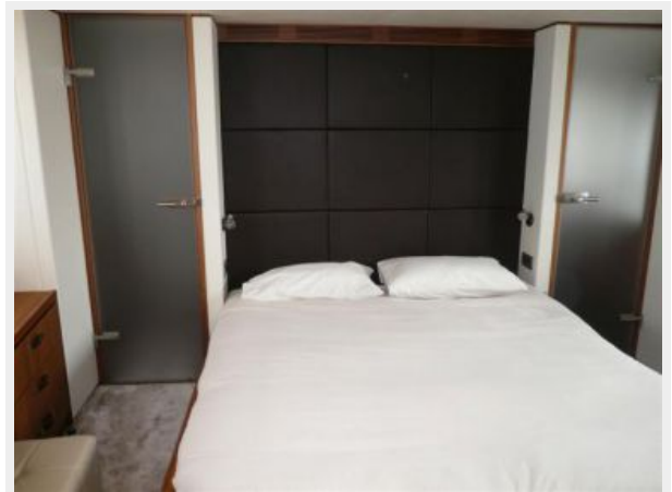
Master Cabin 1