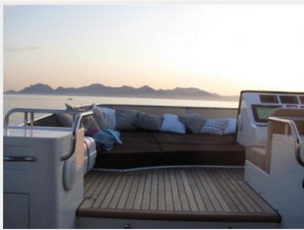
Flybridge Sunbathing 1