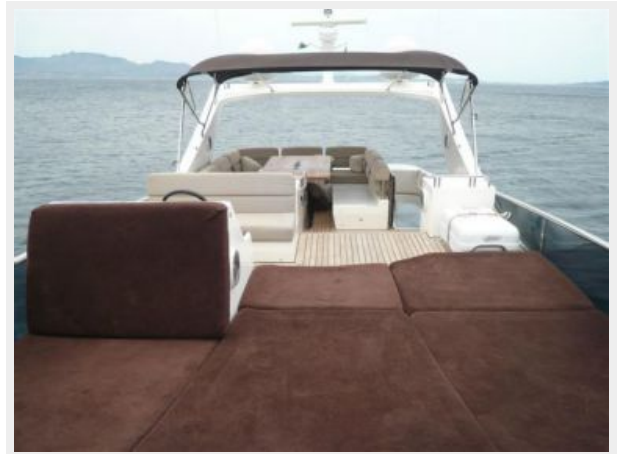
Flybridge Sunbathing 2