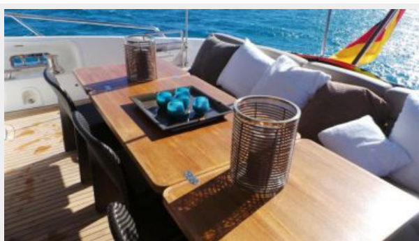
Aft Cockpit Dining 2