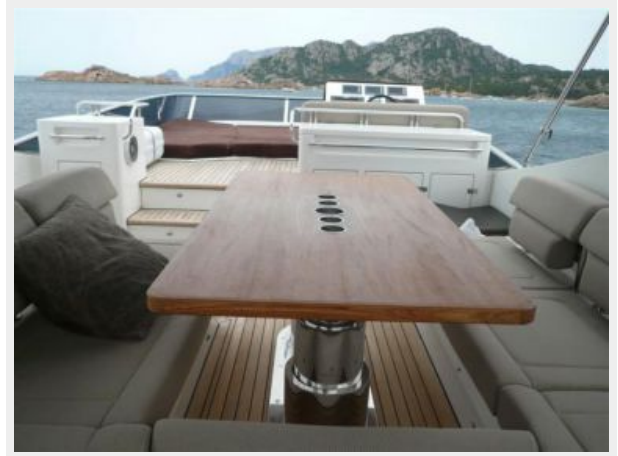
Flying Bridge Dining