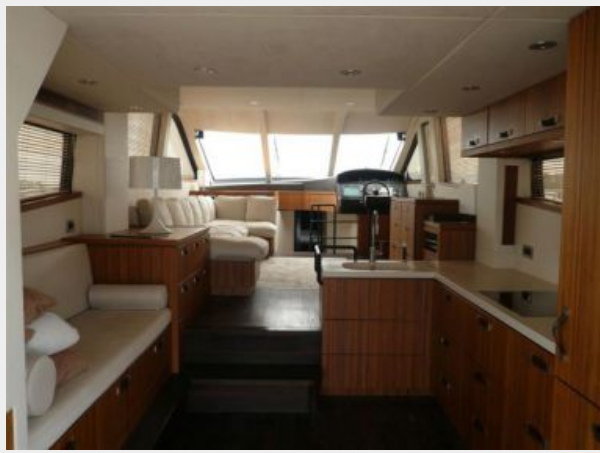
Main Salon 1