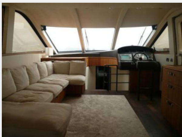
Main Salon 3