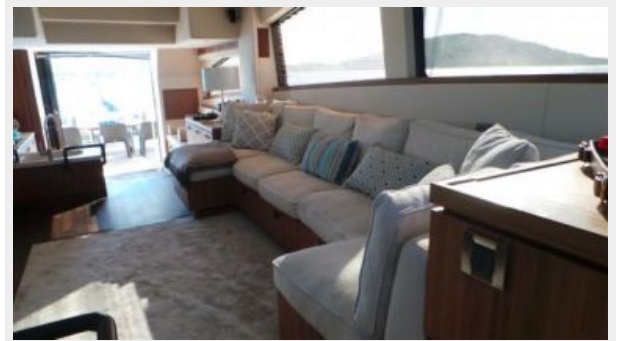
Main Salon 2