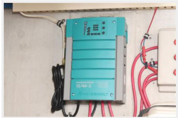
Mastervolt Battery Charger 12V 3 bank