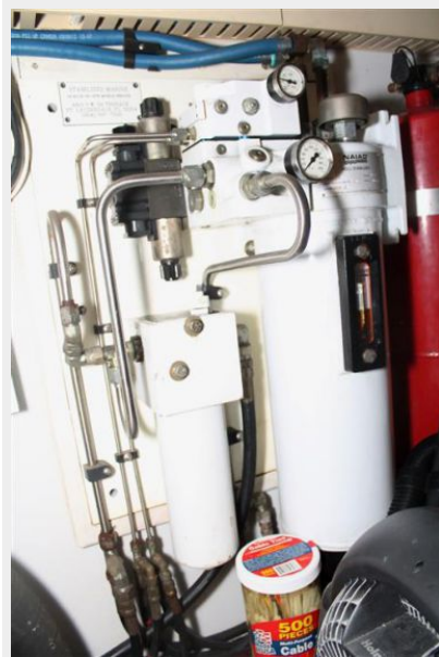
Niad Stabilizer System