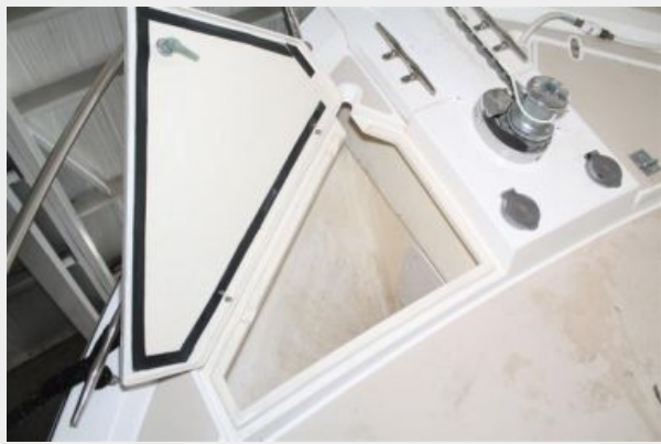
Port Anchor Locker