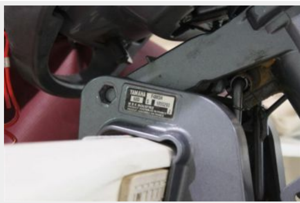
OB Serial No