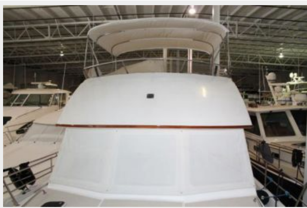
From the Bow