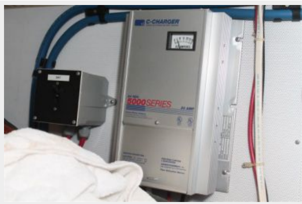
Charles 24V Charger