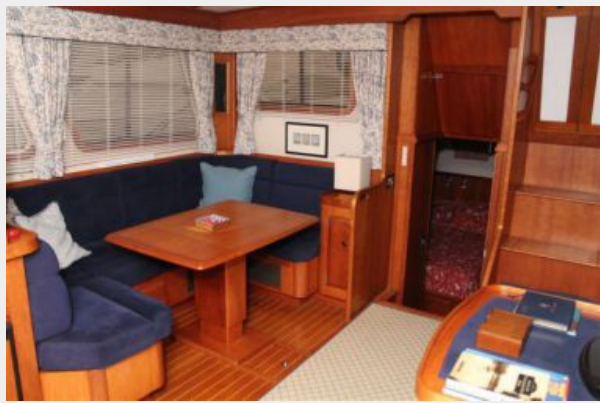
U-Shaped Settee w/Drop Leaf Table