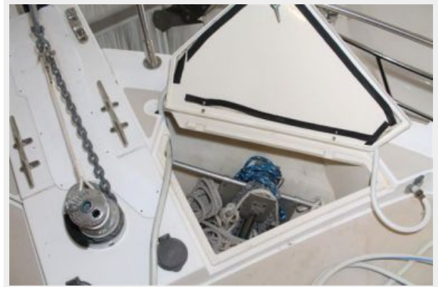
Starboard Anchor Locker - Fortress Anchor