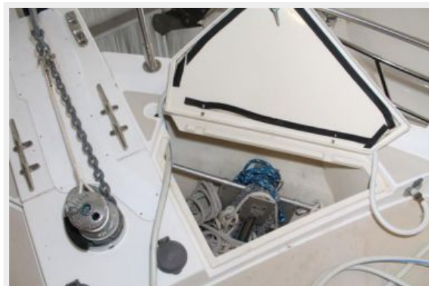
Starboard Anchor Locker - Fortress Anchor