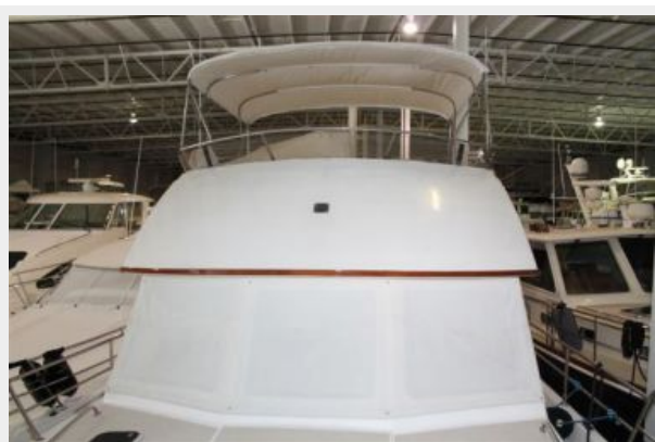
From the Bow