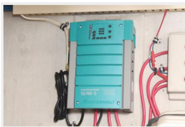
Mastervolt Battery Charger 12V 3 bank