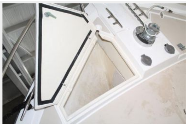
Port Anchor Locker