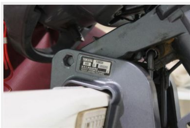
OB Serial No