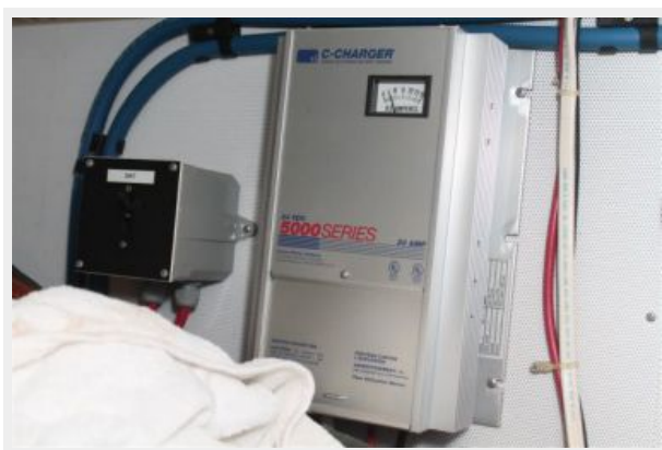
Charles 24V Charger