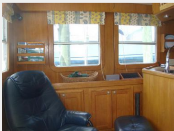
40' Nordhavn salon port