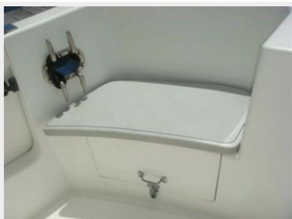
40' Nordhavn aftdeck seating