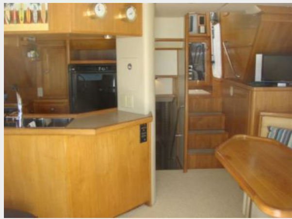
40' Nordhavn salon forward