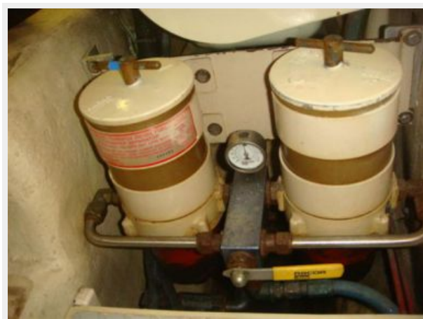
40' Nordhavn Racor fuel filters