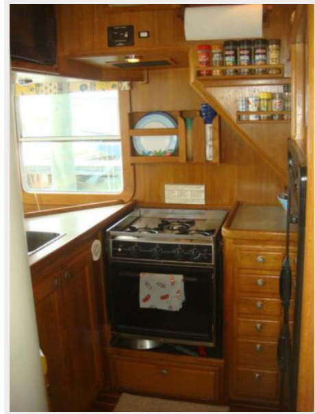
40' Nordhavn galley photo2