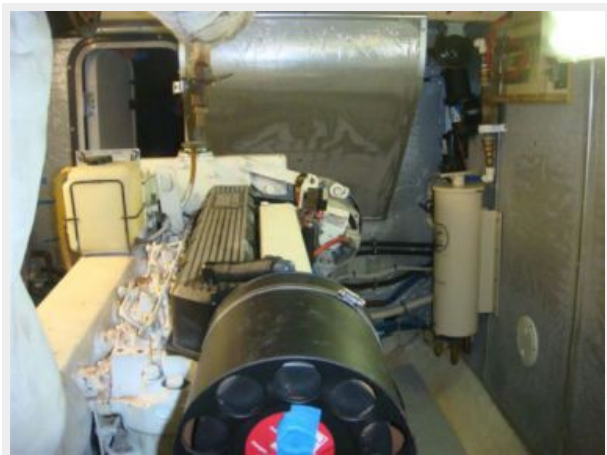
40' Nordhavn engine room forward