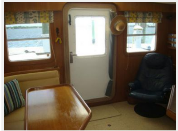
40' Nordhavn salon aft