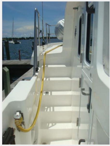
40' Nordhavn starboard side deck