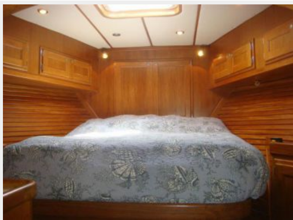
40' Nordhavn master stateroom