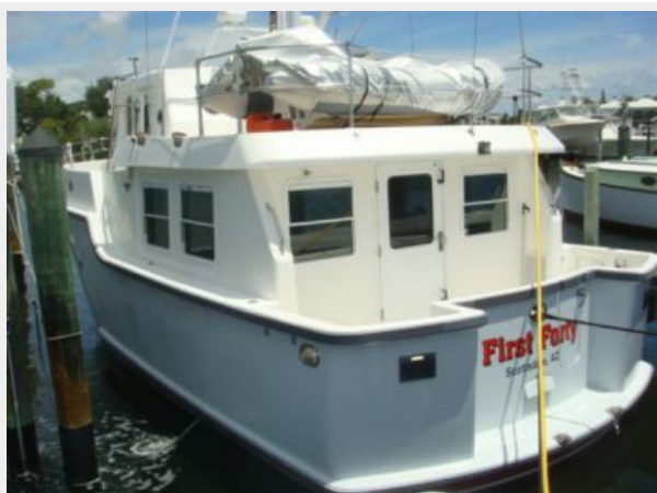
40' Nordhavn port aft profile