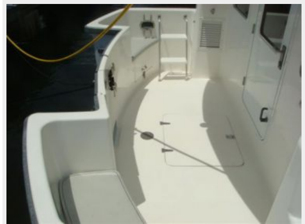
40' Nordhavn aftdeck