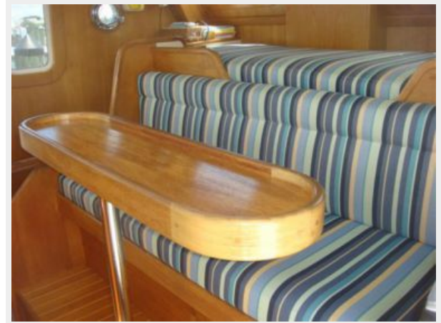
40' Nordhavn pilothouse seating photo2