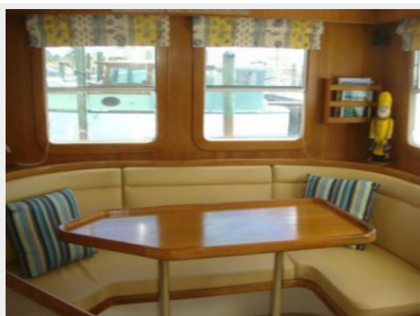
40' Nordhavn salon starboard