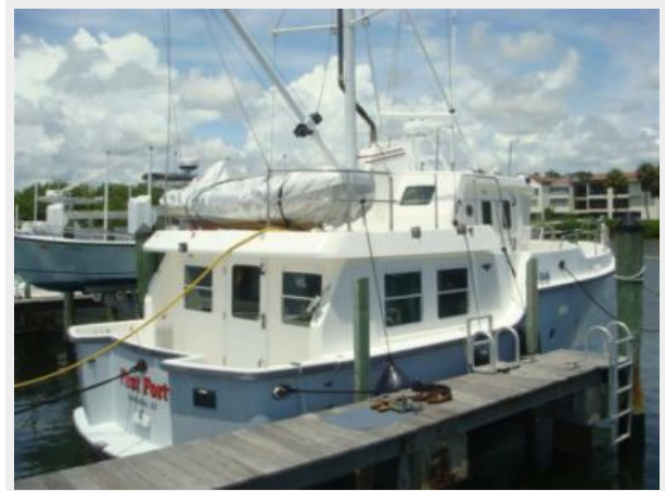
40' Nordhavn starboard aft profile