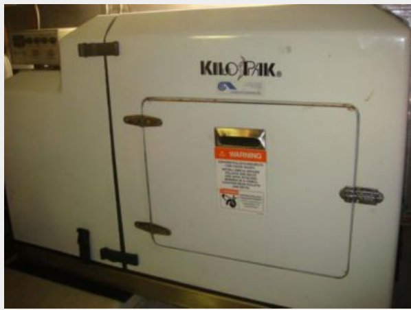
40' Nordhavn generator sound box