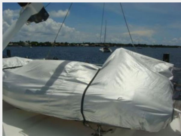
40' Nordhavn tender