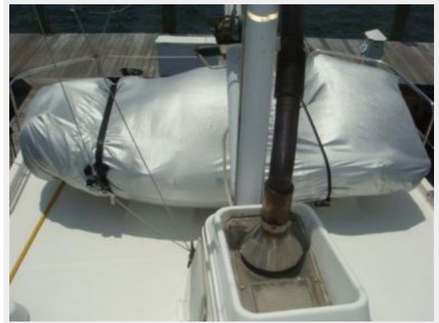
40' Nordhavn flybridge