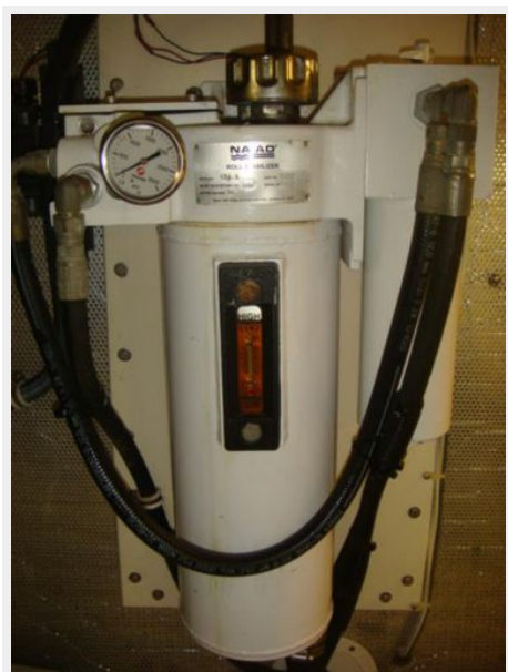
40' Nordhavn stabilizer system