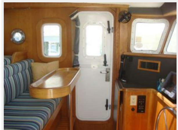
40' Nordhavn pilothouse port