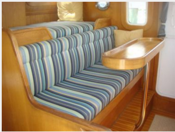
40' Nordhavn pilothouse seating photo1