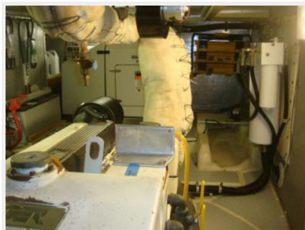
40' Nordhavn engine room aft