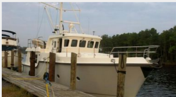
40' Nordhavn starboard forward profile