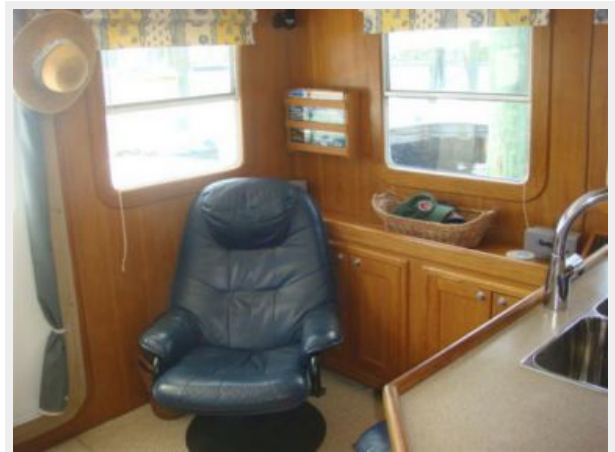
40' Nordhavn salon port aft