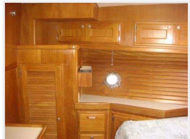
40' Nordhavn washer-dryer