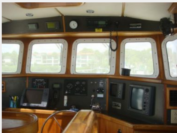
40' Nordhavn pilothouse forward