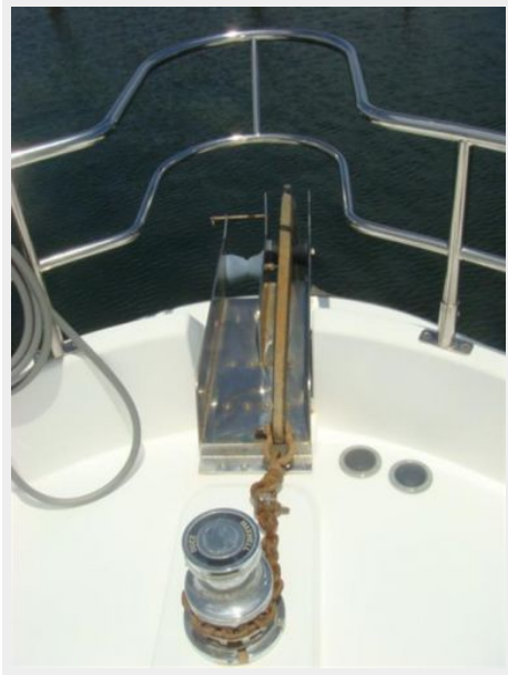
40' Nordhavn anchor windlass