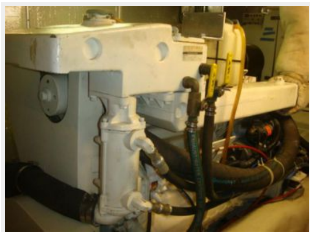
40' Nordhavn main engine