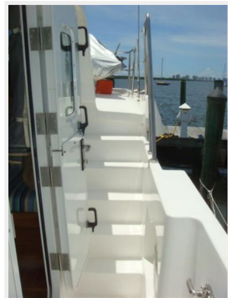
40' Nordhavn port side deck