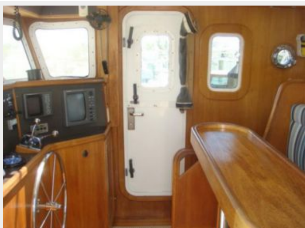
40' Nordhavn pilothouse starboard