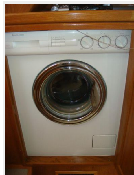
40' Nordhavn washer-dryer