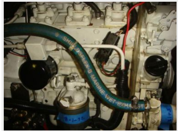
40' Nordhavn generator