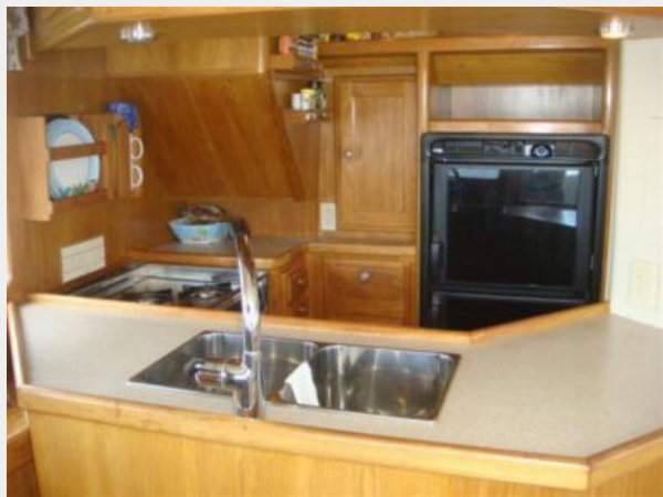
40' Nordhavn galley photo1