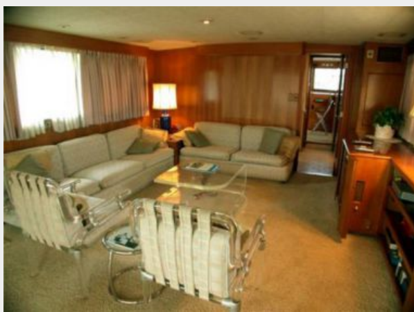
Main Salon Looking Forward