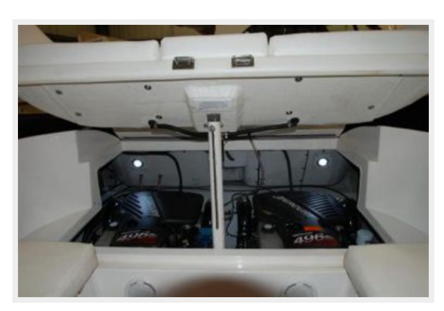
Twin MerCruiser 496 MAG HO