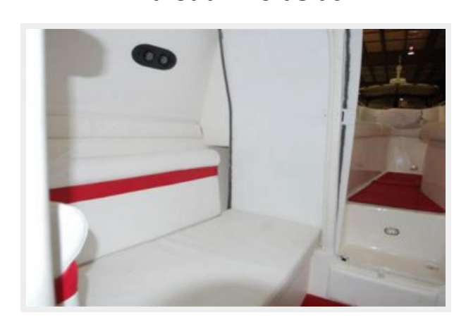
Mid-Cabin Port Side