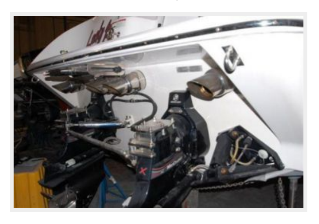
Envision 36 Drive System - Brovo I