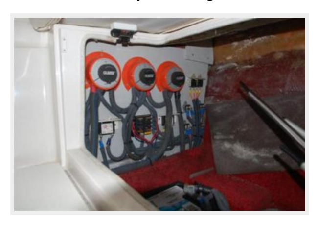
Electrical Battery Switches - Under port cockpit seating.