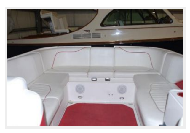
Aft Cockpit Seating