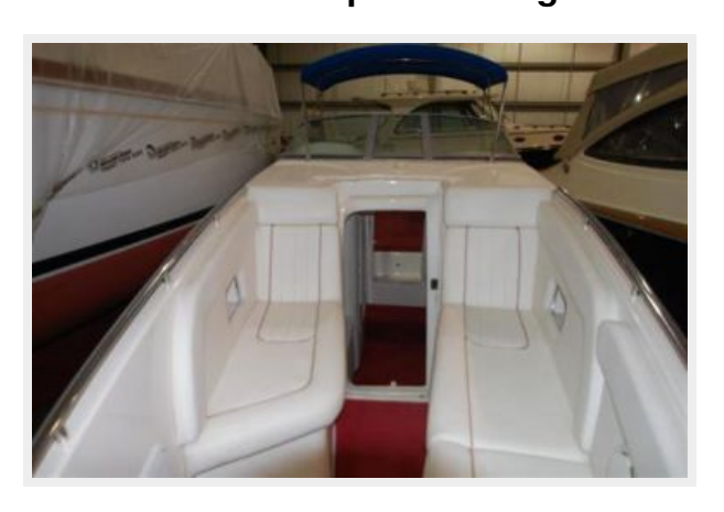
Forward Cockpit / Looking aft