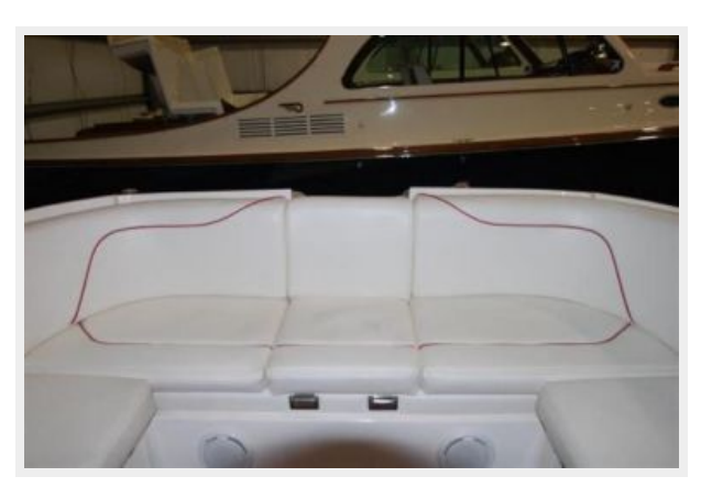
Aft Cockpit Seat