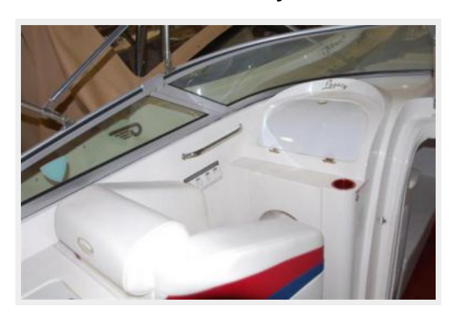
Port side buddy seat