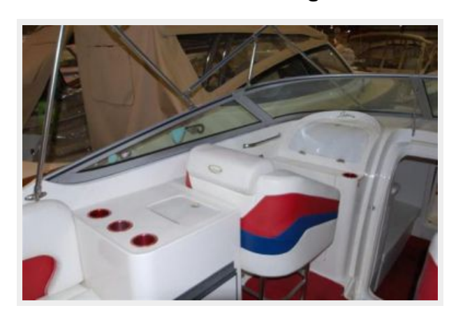
Port side seating