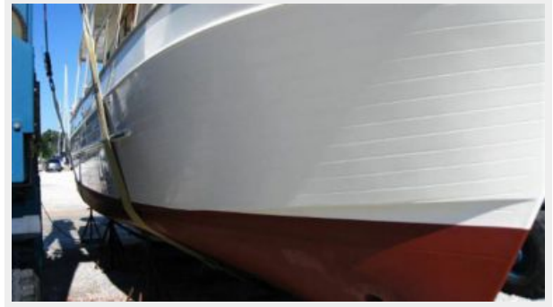
July Haulout 4