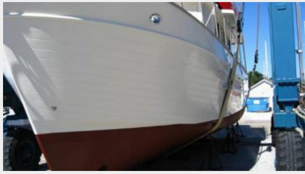
July Haulout 3