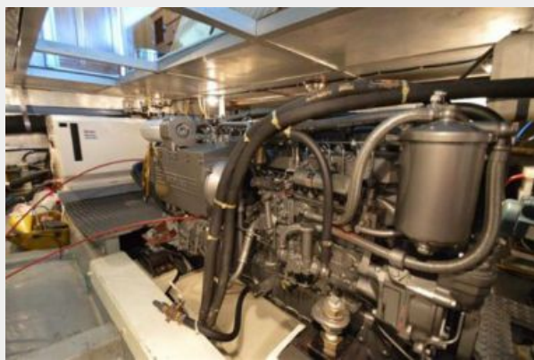
Engine Room 3