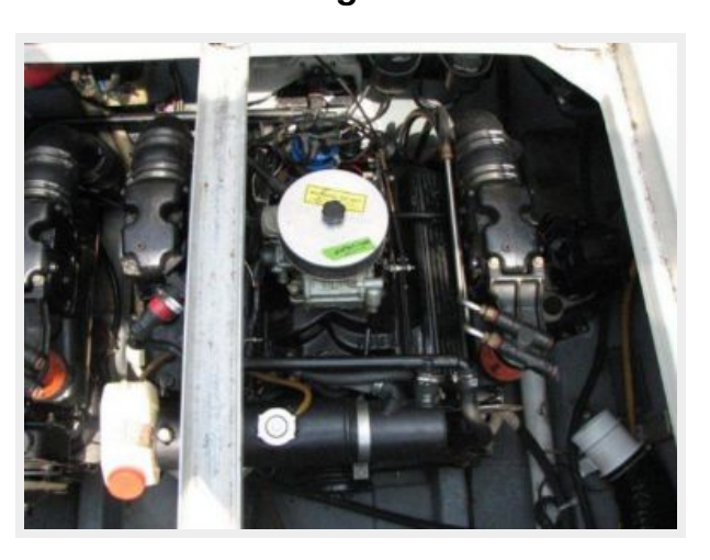
Engine & Mechanical Equipment 3 - Outdrives