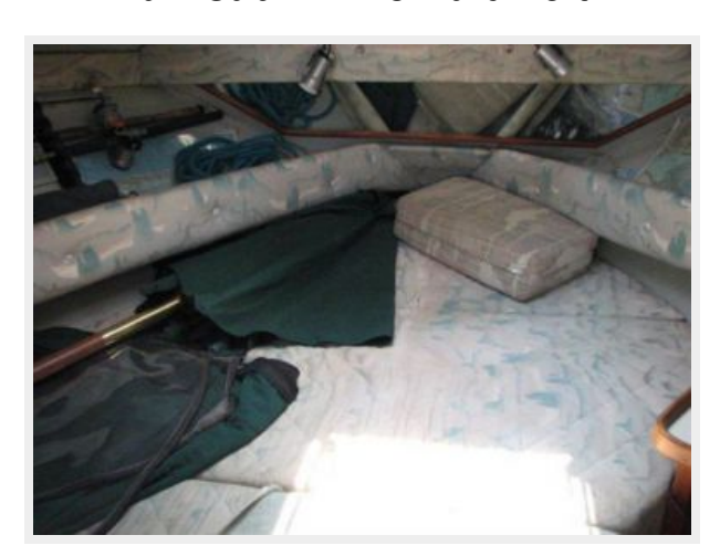
Main Cabin 2 - Forward Berth