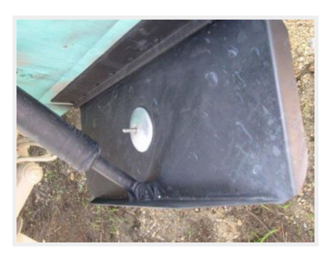
Engine & Mechanical Equipment 4 - Trim Tabs