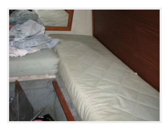
Main Cabin 3 - Aft Cabin Berth