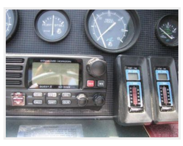
Helm / Electronics & Navigation 4