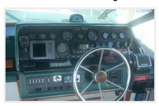
Helm / Electronics & Navigation 2