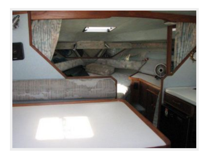
Main Cabin 1