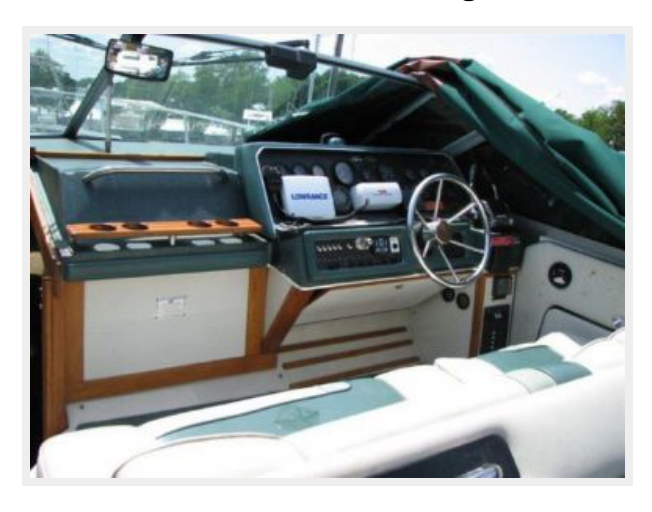
Helm / Electronics & Navigation 1