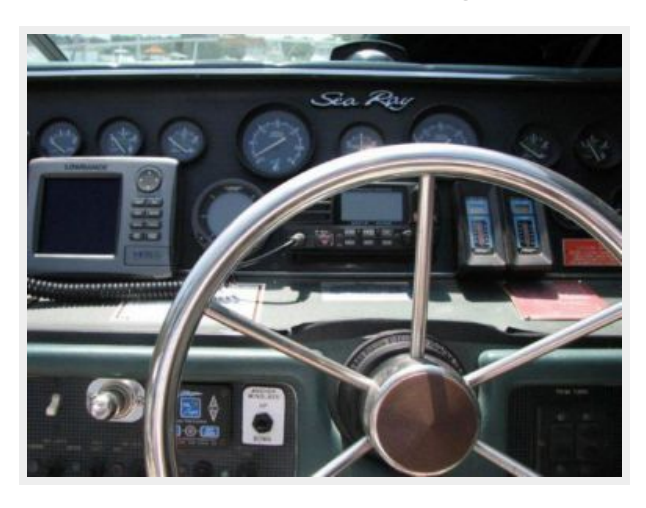
Helm / Electronics & Navigation 3