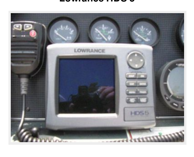
Helm / Electronics & Navigation 5 - Lowrance HDS 5