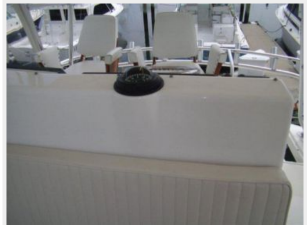
Helm / Electronics & Navigation 4 - Compass