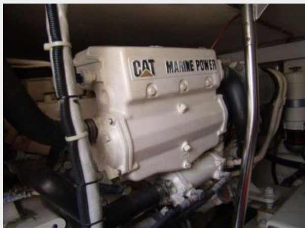
Engine & Mechanical Equipment 3