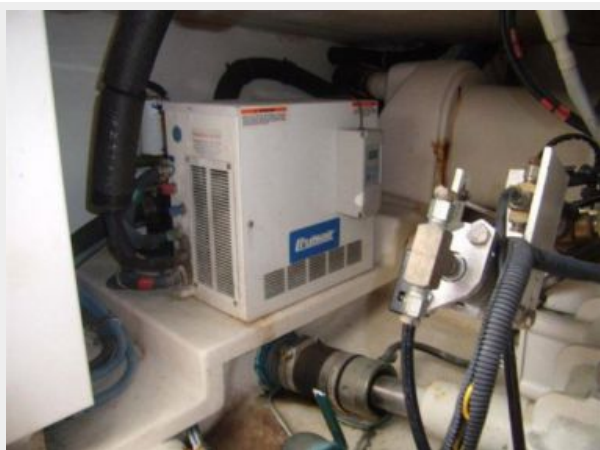
Engine & Mechanical Equipment 5