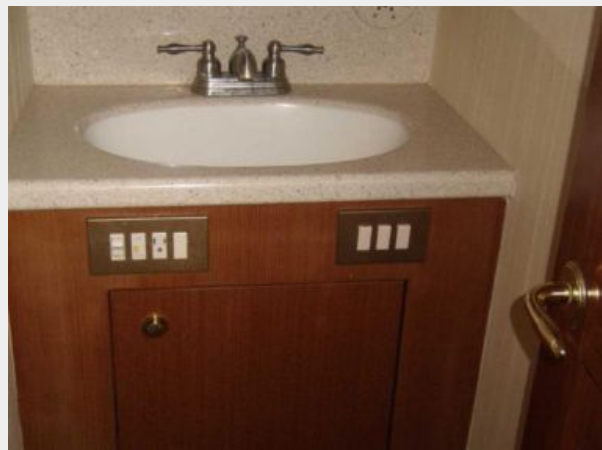
Master Head 1