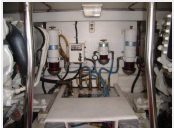
Engine & Mechanical Equipment 4