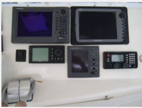
Helm / Electronics & Navigation 3