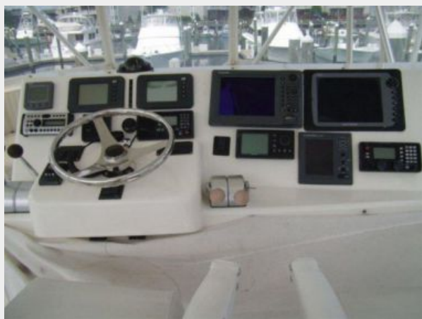
Helm / Electronics & Navigation 1