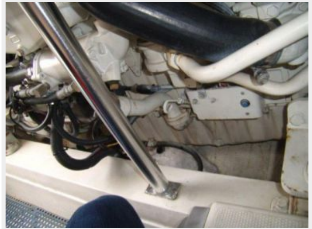
Engine & Mechanical Equipment 2