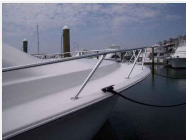
Deck 1 - Bow