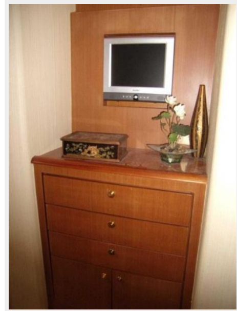
Master Stateroom - TV