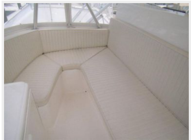
Deck 2 - Seating