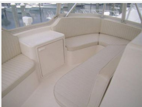
Deck 3 - Seating