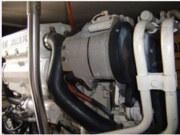
Engine & Mechanical Equipment 1