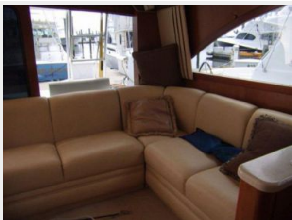
Salon 1 - Sofa