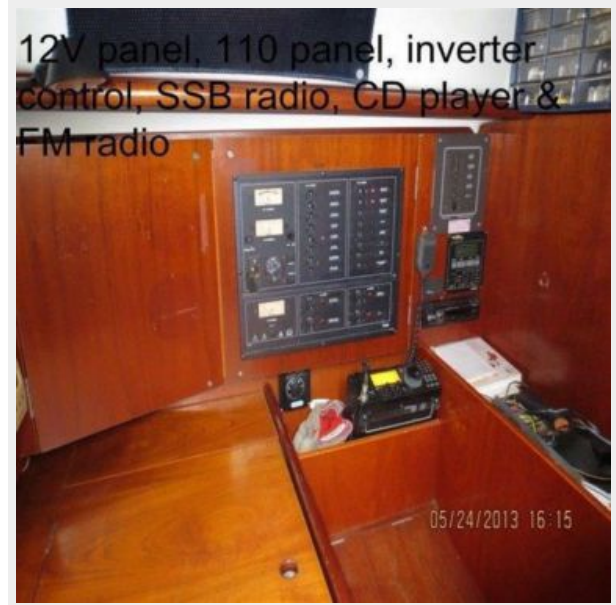
12V panel, 110 panel, inverter control, SSB radio, CD player & FM radio