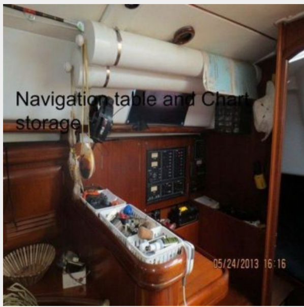
Navigation table and Chart storage