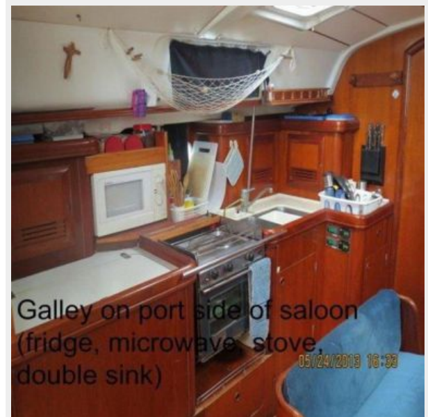
Galley on port side of saloon (fridge, microwave, stove, double sink)