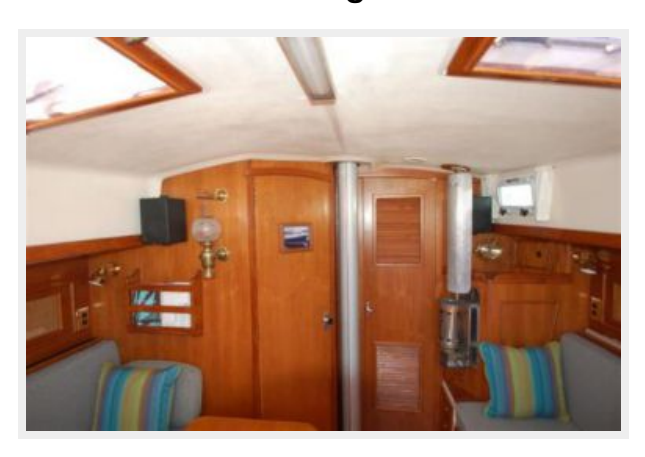
Salon looking forward