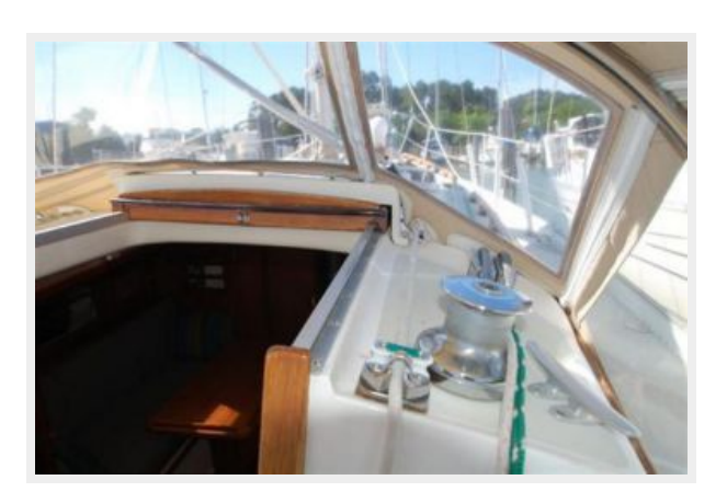
Lines led aft for easy sailing