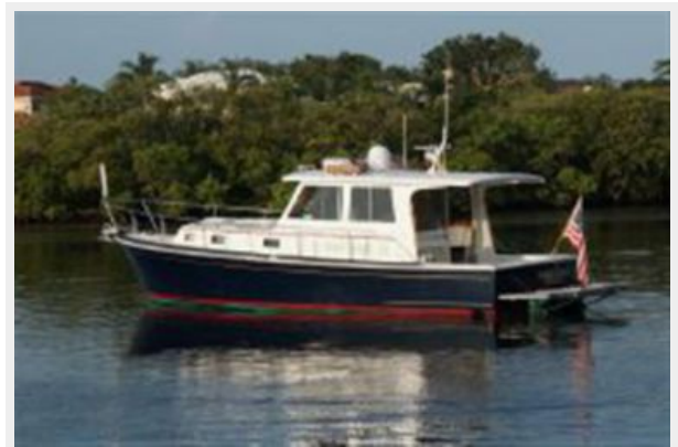
PORT QUARTER VIEW