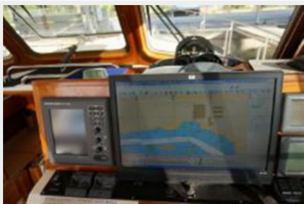
HELM LEFT SIDE