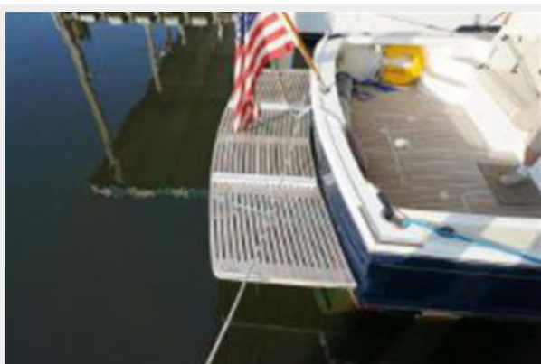
TNT PLATFORM UP