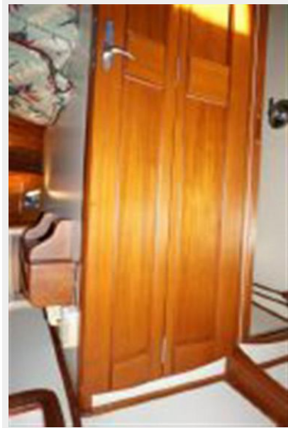
FORWARD CABIN DOOR