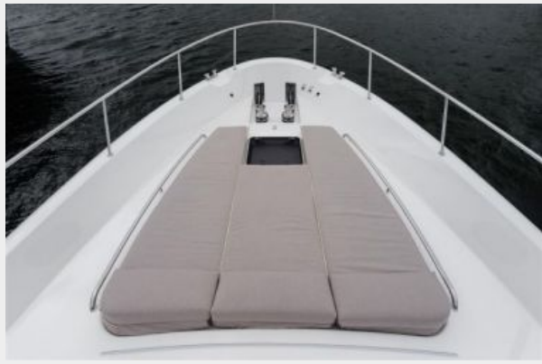
Bow / Sun Pad