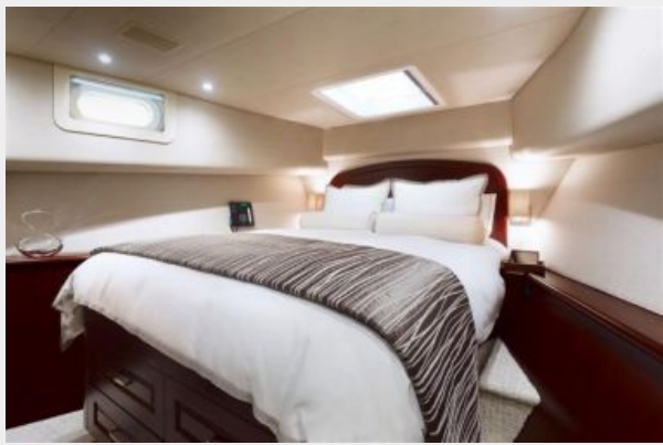
VIP Stateroom / Forward