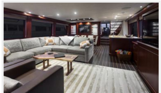
Salon / Bar