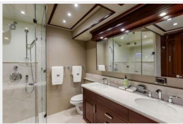
VIP Stateroom / Starboard