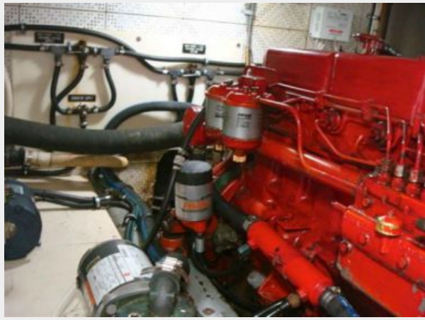
41' DeFever engine room starboard aft