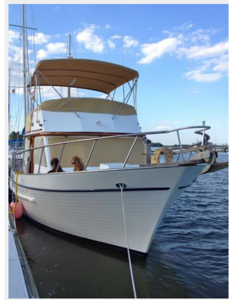
41' DeFever forward profile