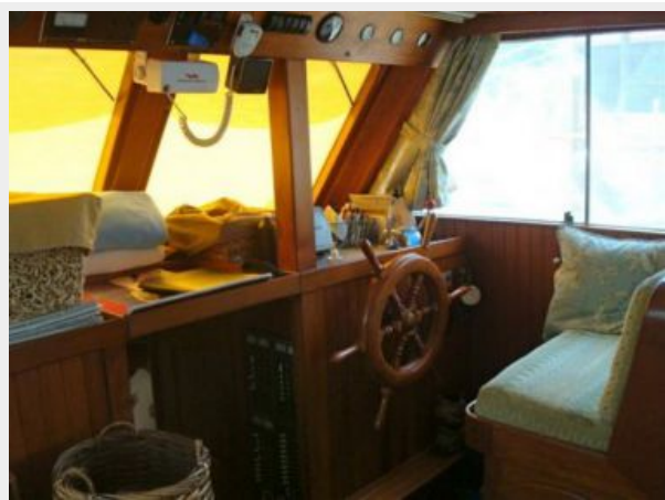
41' DeFever lower helm photo1