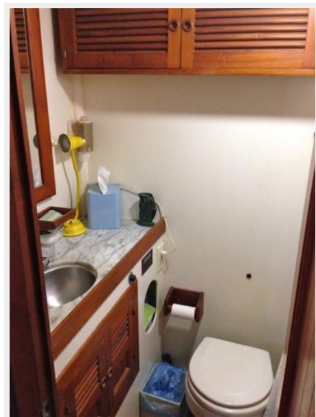
41' DeFever master stateroom head