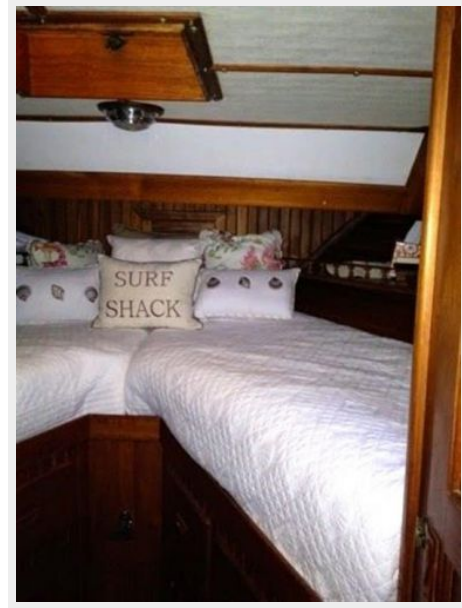
41' DeFever guest stateroom