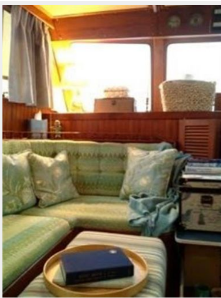
41' DeFever salon forward