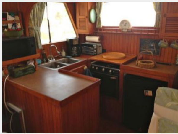
41' DeFever galley photo1