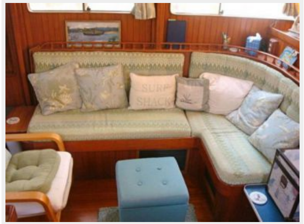
41' DeFever salon seating photo2