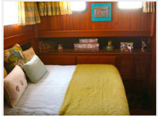
41' DeFever master stateroom head