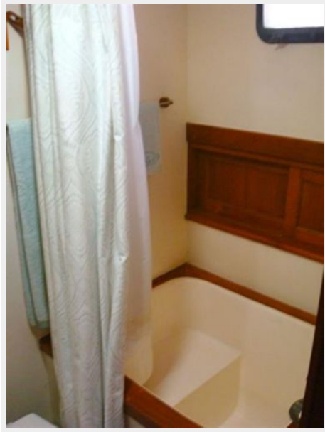
41' DeFever master stateroom tub-shower