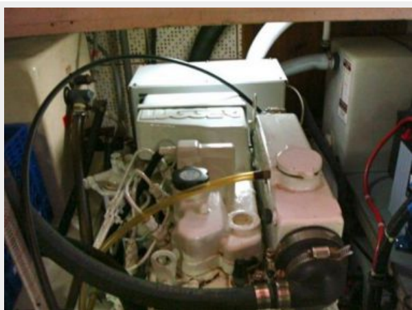
41' DeFever generator