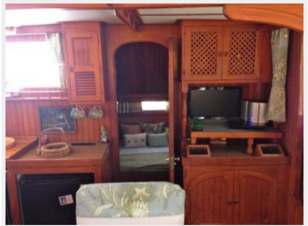
41' DeFever galley photo2