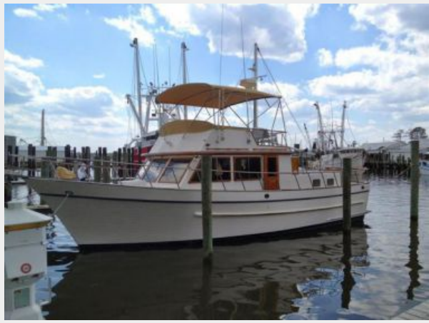
41' DeFever port profile