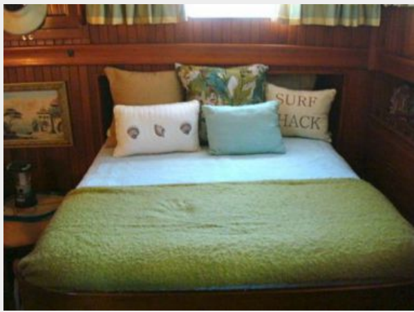
41' DeFever master stateroom