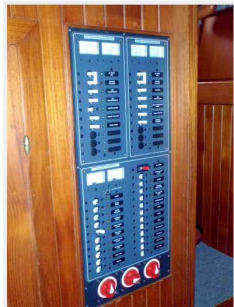
41' DeFever electrical panel