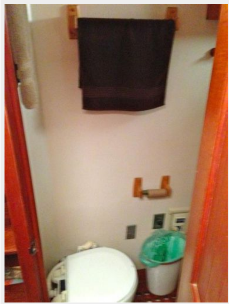
41' DeFever guest stateroom head