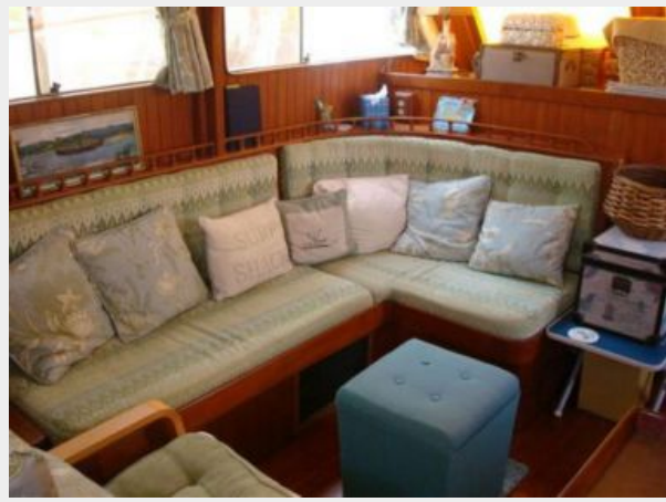
41' DeFever salon seating photo1