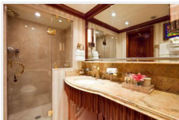
Guest Bathroom (Starboard)