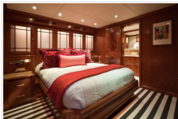
Guest Stateroom (Port)