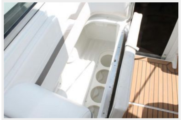
In Floor Ski Storage