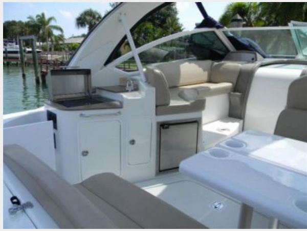
Cockpit "Summer Kitchen"