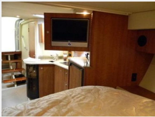
Master Stateroom TV