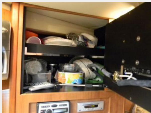
Storage behind TV