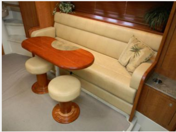
Salon couch, table, and stools