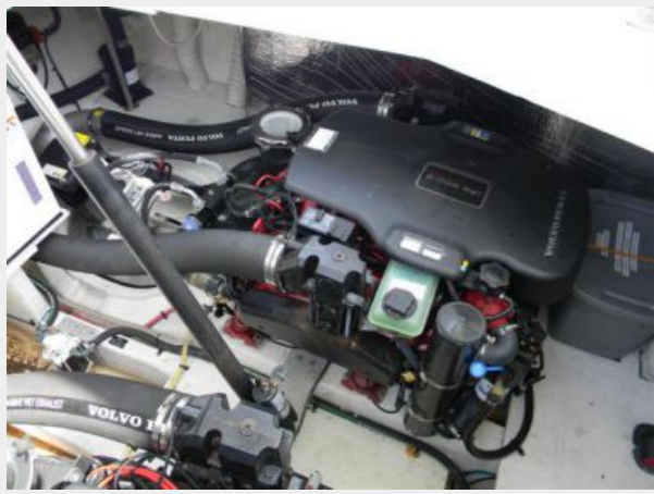
Port Engine and IPS Drive