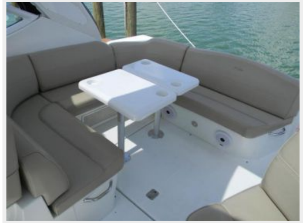
Cockpit Dinette w/ Tables