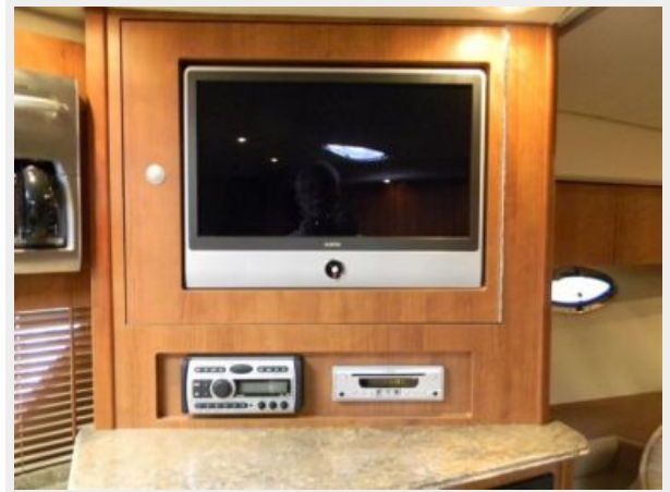
Salon TV and Stereo