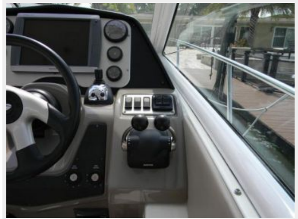
Volvo Electronic Binnacle and Joystick