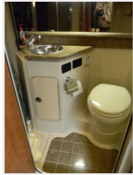
Head and Vanity