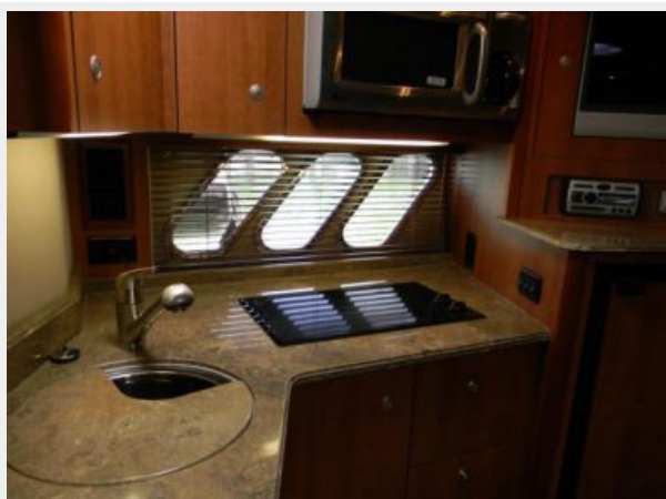
Galley Top and Vertical Ports