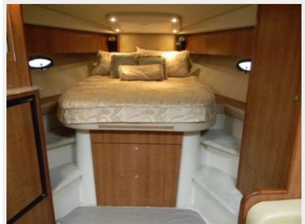
Centerline Island Berth