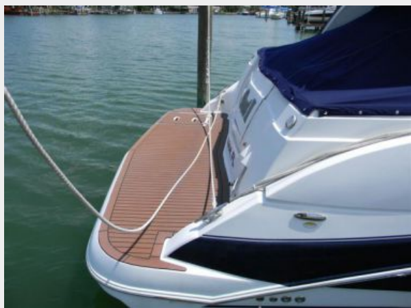
Integrated Platform and Synthetic Teak