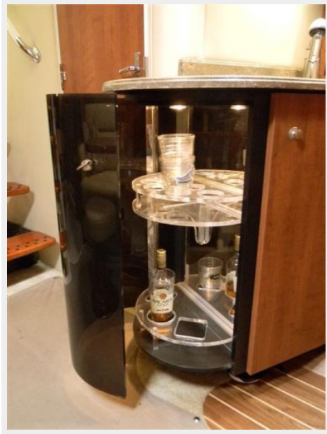
Lighted Bottle Storage