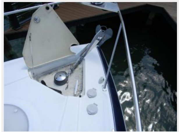
Recessed Windlass and Line Storage