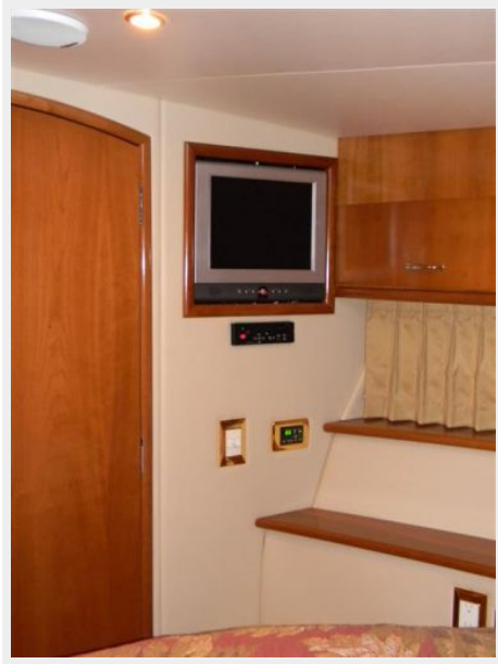
VIP Stateroom TV & DVD