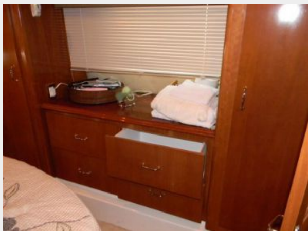
Master Stateroom Drawers