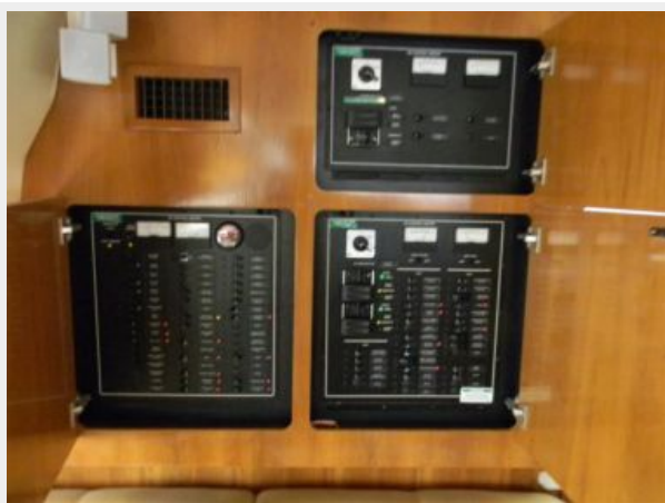
Electrical Distribution Panel