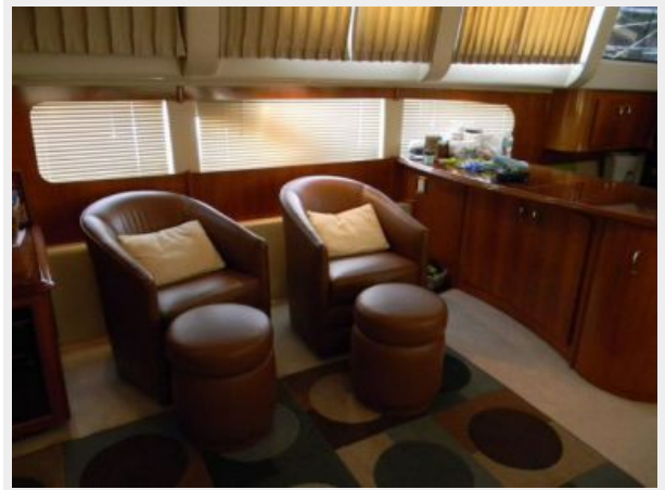
Barrel Chairs & Ottomans