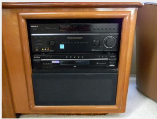
Salon Entertainment Center