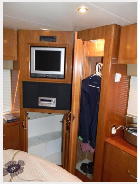
Master Statroom Storage Closet