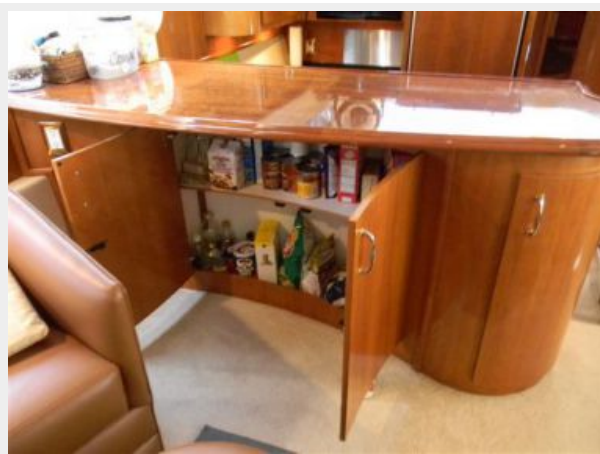
Breakfast Bar Storage