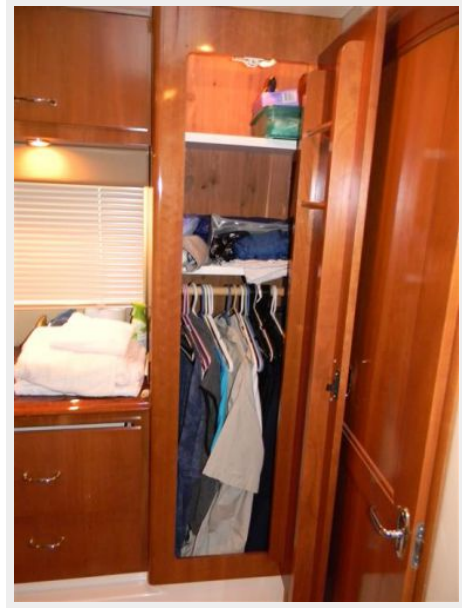
Master Statroom Closet