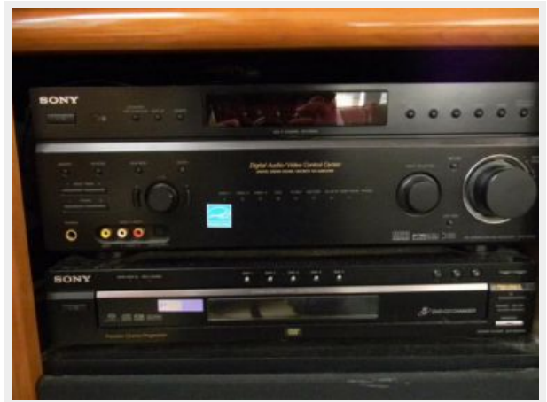
Salon Entertainment Stereo - Sony