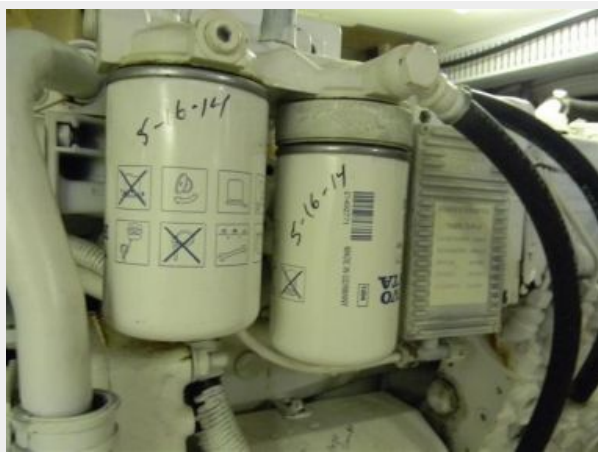
Engine Recently Serviced - 5/14