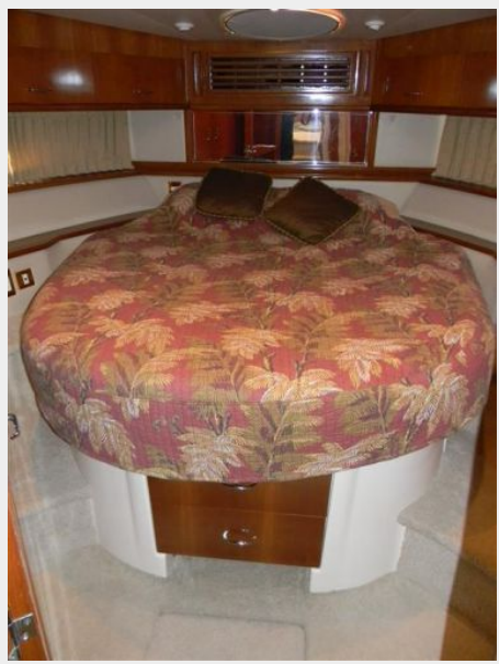
VIP Stateroom Berth