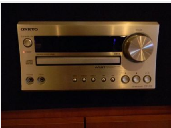
Master Stateroom Stereo/DVD