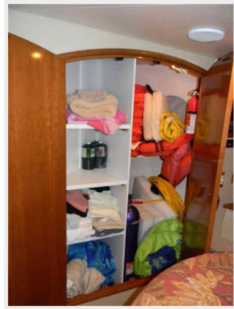
VIP Stateroom Closet