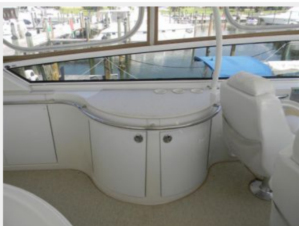
Flybridge Storage & Countertop