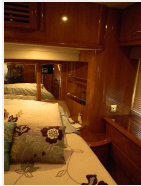
Master Statroom Side Table