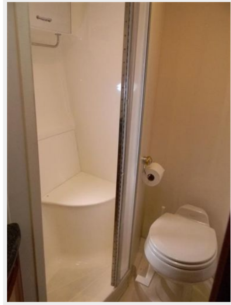
Guest Shower Stall