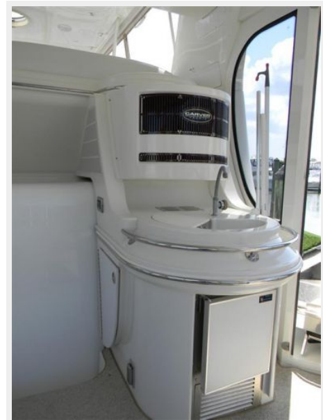
Aft Deck Wet Bar & AC