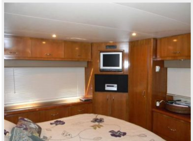
Master Stateroom TV