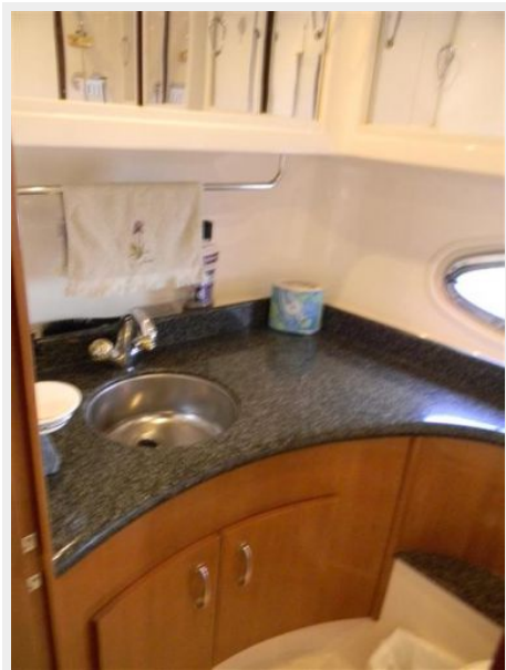
Master Head Vanity