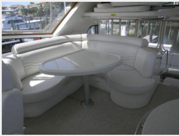
Bridge Dinette Lounge