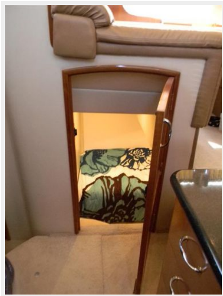
Third Stateroom Entry Door