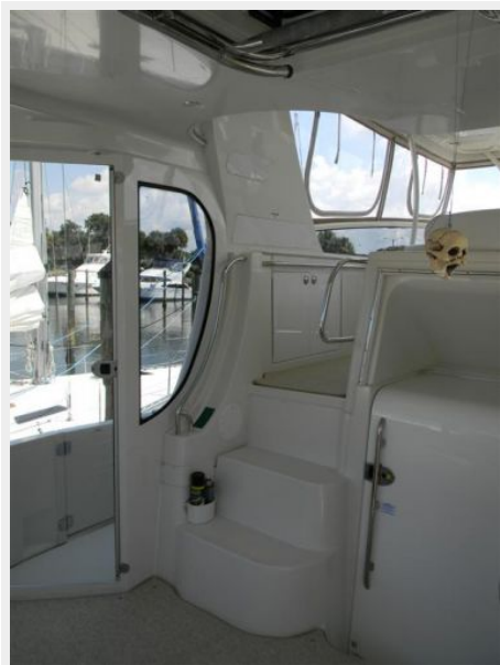
Steps to Flybridge