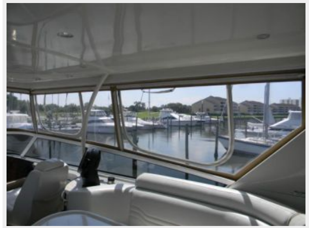
Enclosures in Excellent Shape